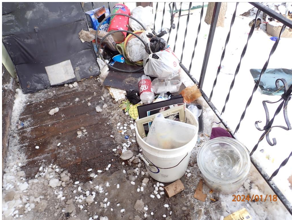
Exterior of the property