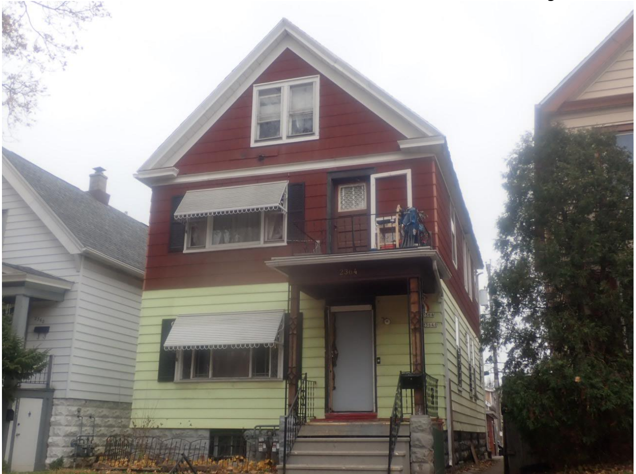
2364 South 20 th Street (Exterior, above), Splice in to circuit below