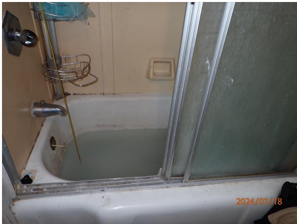
Above: Bathroom. Below: Basement sleeping quarters