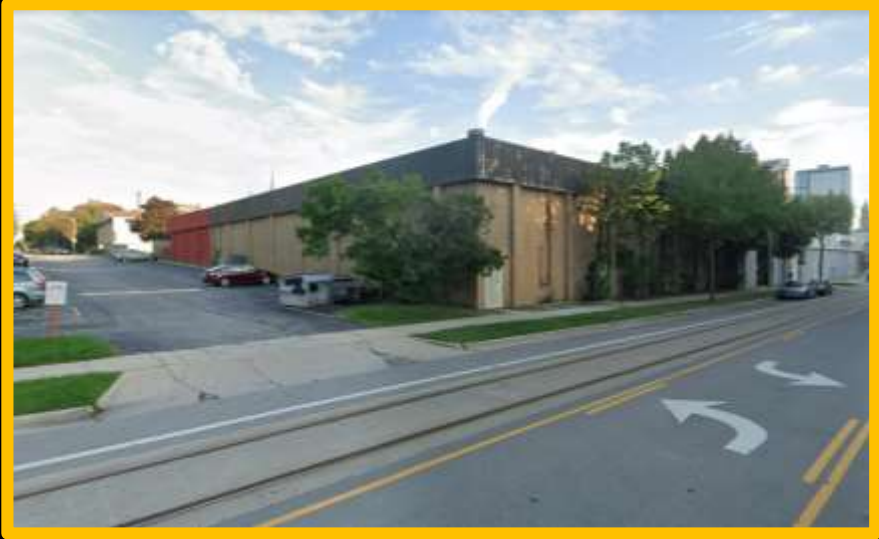
View from North Jackson Street looking south-east