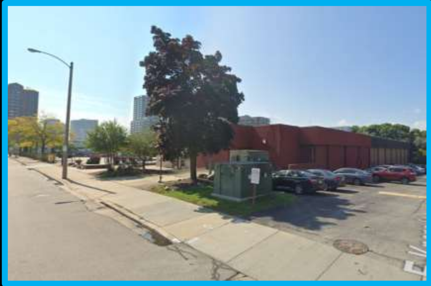
View from Van Buren and Knapp looking south-west