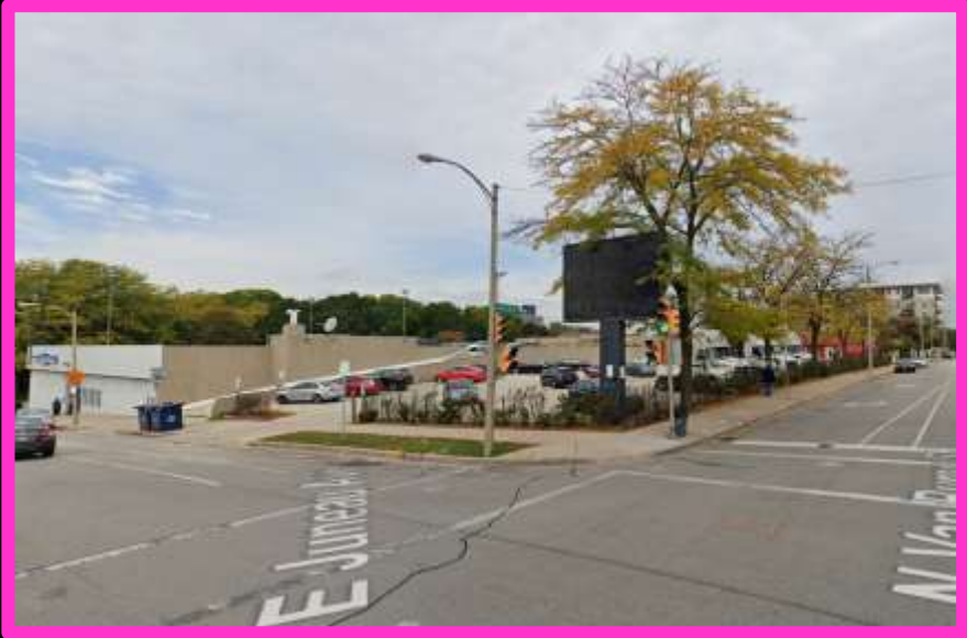
View from Juneau and Van Buren looking north-west