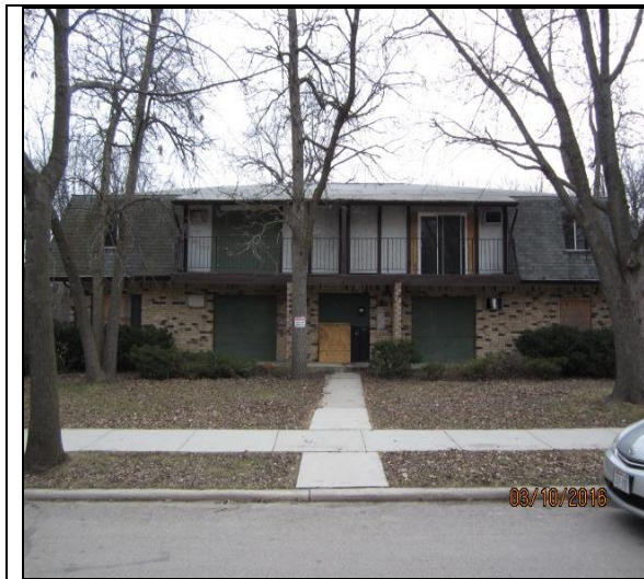
CITY MULTI-FAMILY PROPERTY FRONT VIEW

8940 North Michele Street (the "Property"): A 6,720 SF two-story, eight-unit apartment building situated on a 22,660 SF lot, which includes a four-car garage and on-site parking. The building was built in 1980 and was acquired by the City of Milwaukee ("City") on January 4, 2016 through property tax foreclosure.