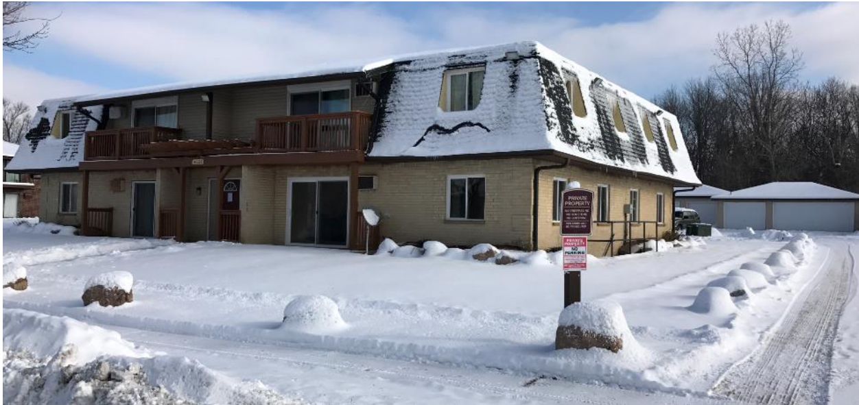
BUYER'S MULTI-FAMILY PROPERTY AT 9020 NORTH 96 TH STREET AFTER RENOVATIONS