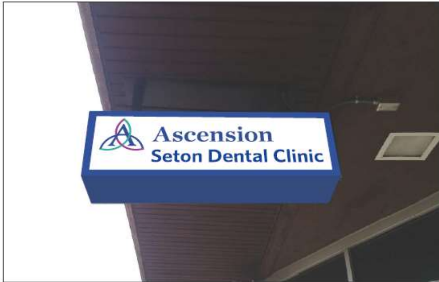
Recommended - Side A