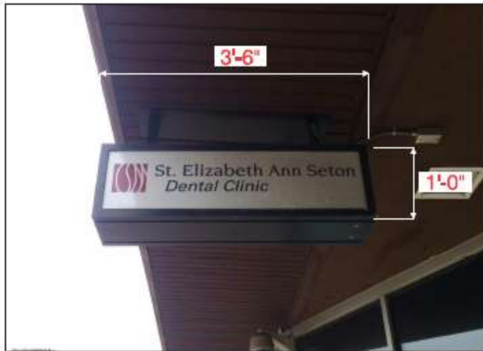
Detail Side A

Above: proposed signage Left: existing with measurements