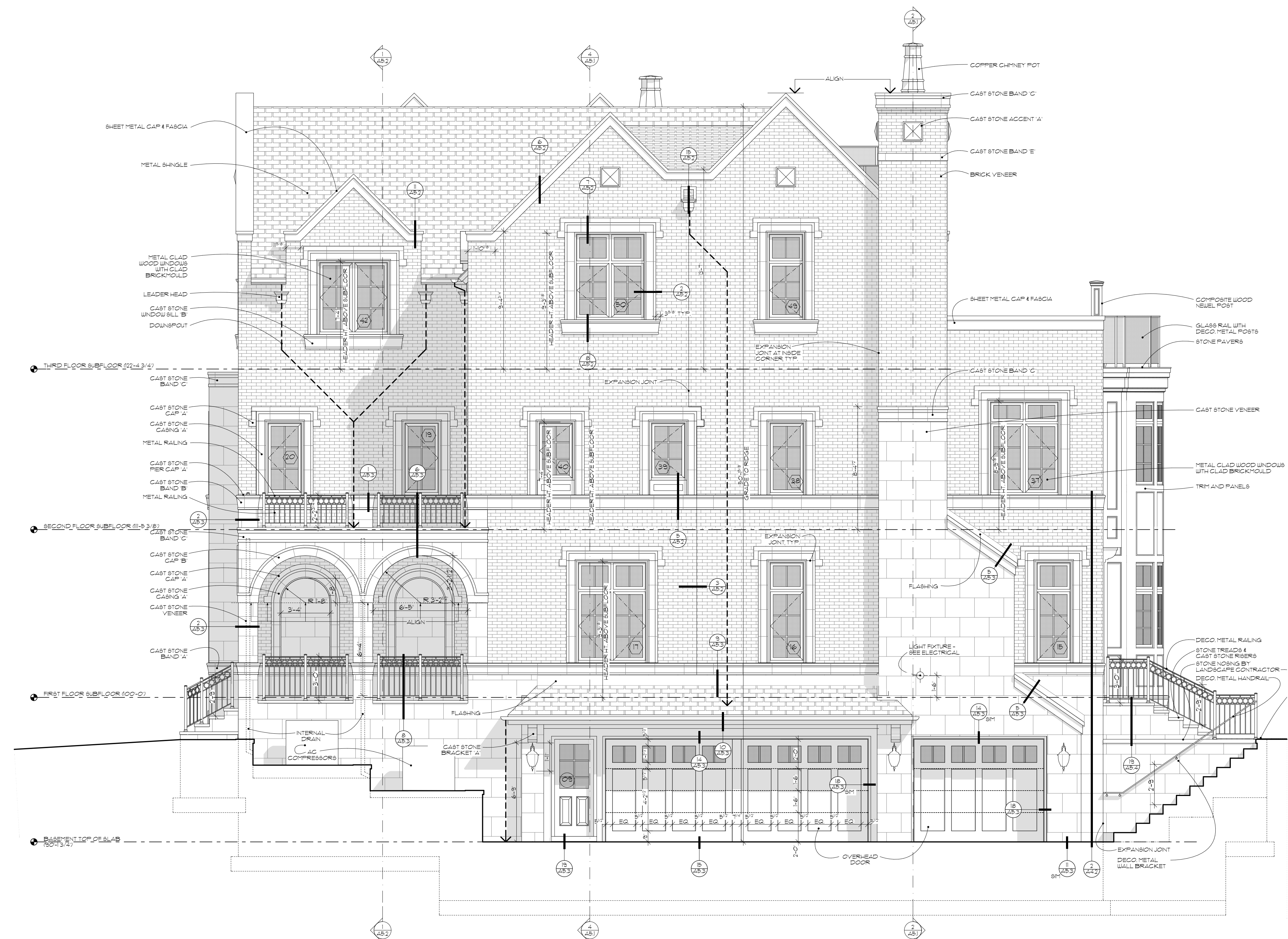
1 WEST ELEVATION SCALE: 1/4" = 1'-0"