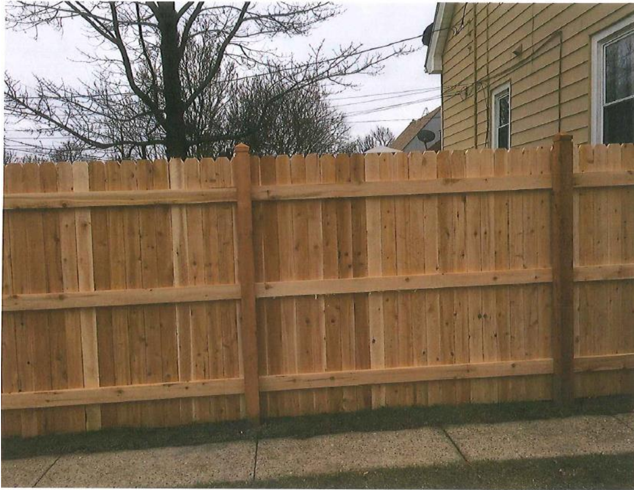
General design. Note that clear-grain wood is required for the 26' section in line with the house.