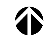
1 ARCHITECTURAL SITE PLAN SCALE: 1" = 40'-0"