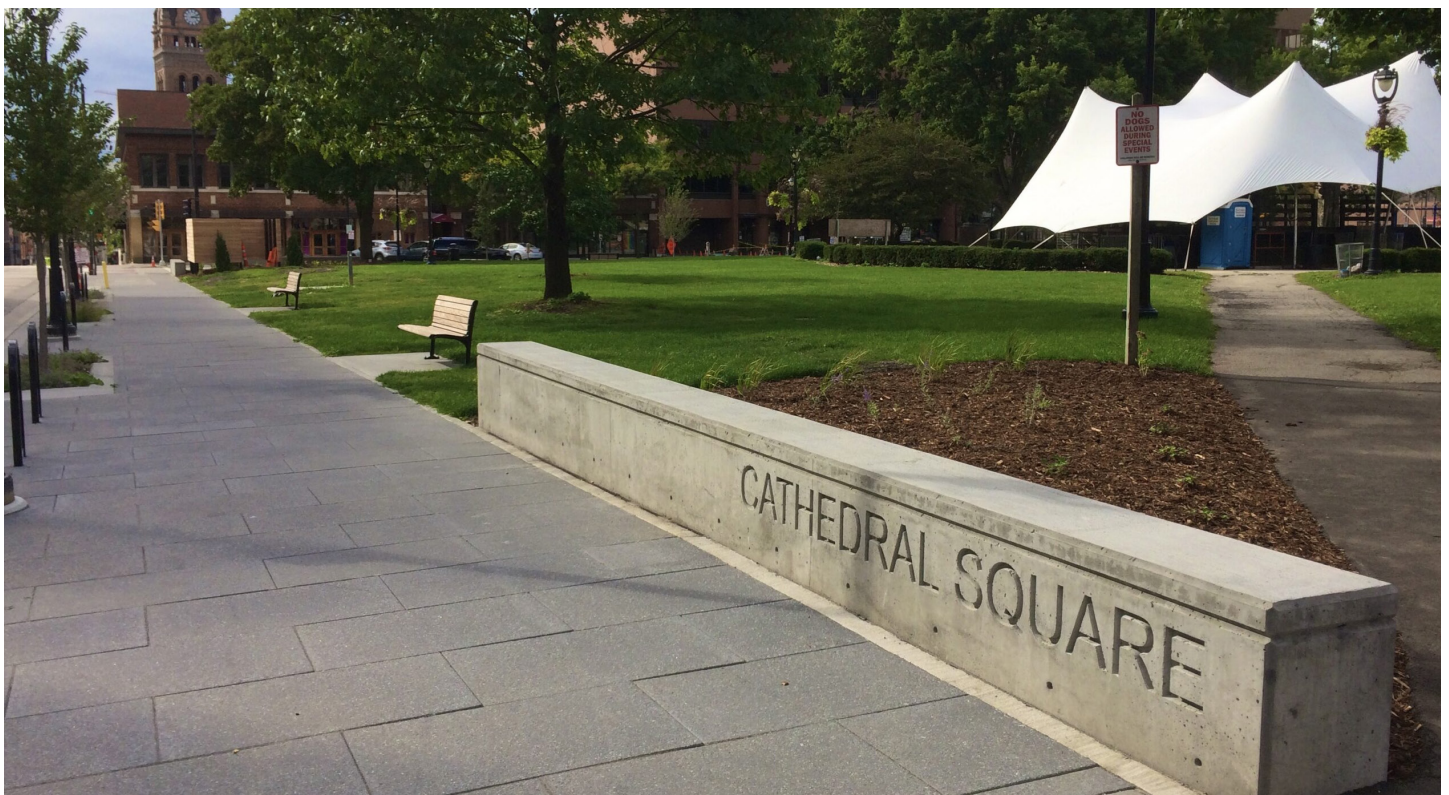
Wells Street Wall Sign Looking West