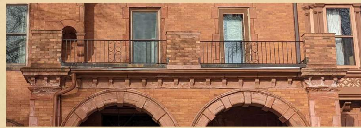
EXISTING BRICK & RAILING