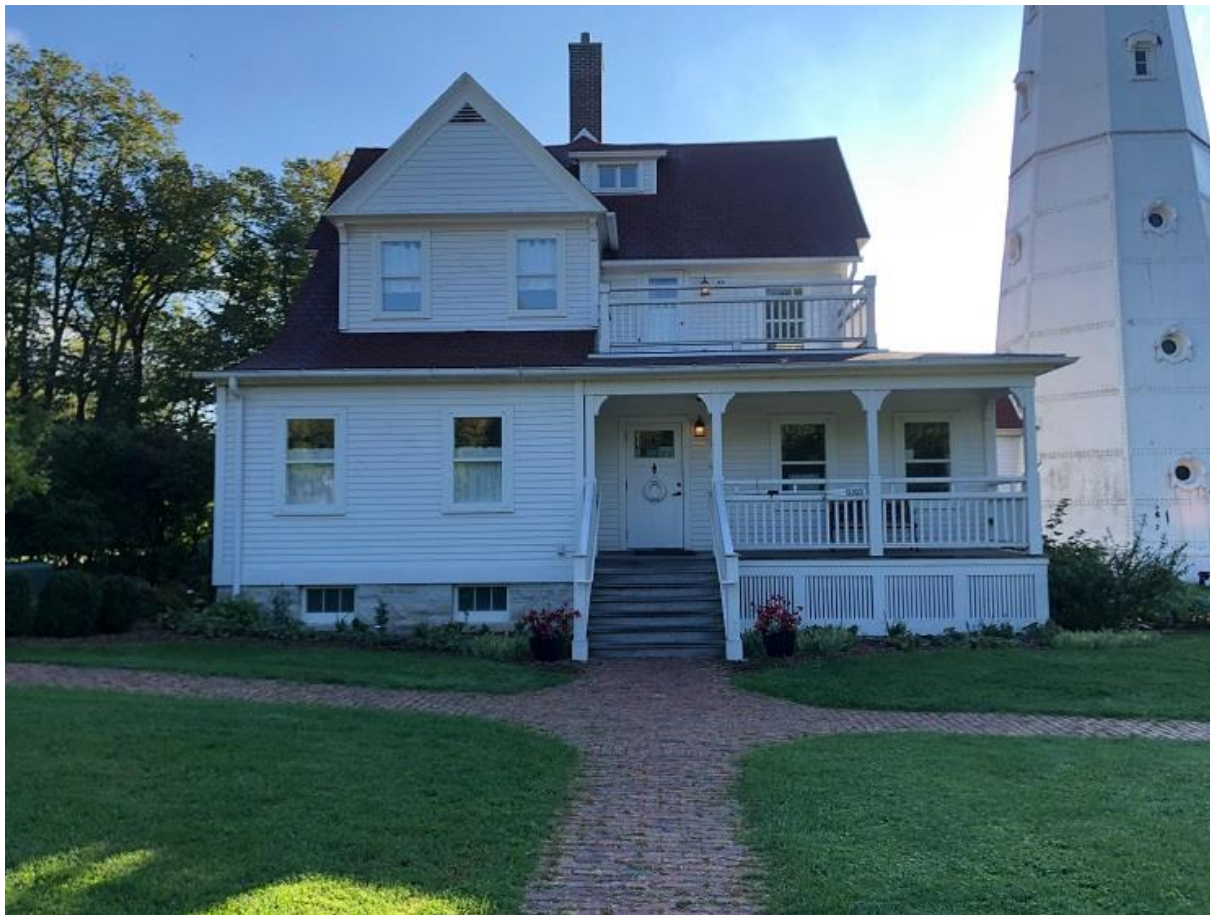
West façade, upper and lower porch railings

Copies to: Development Center, Ald. Brostoff