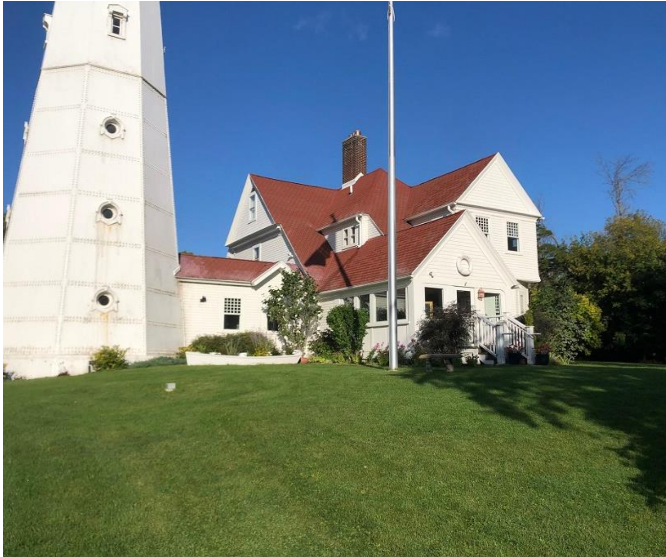
East façade, rear entry