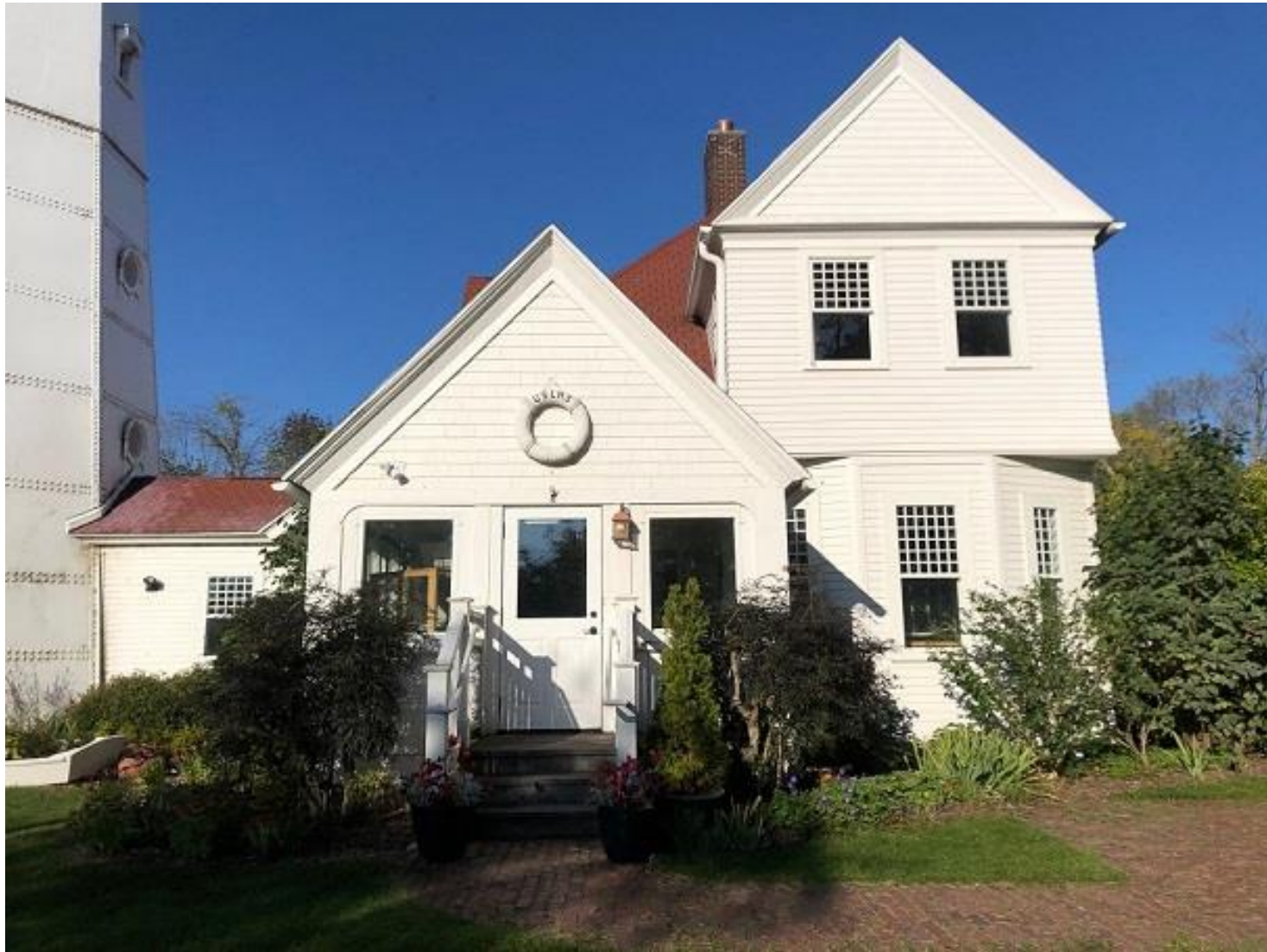
East façade, rear entry