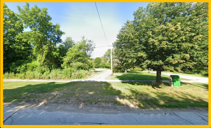
View from North Milwaukee River Parkway looking east