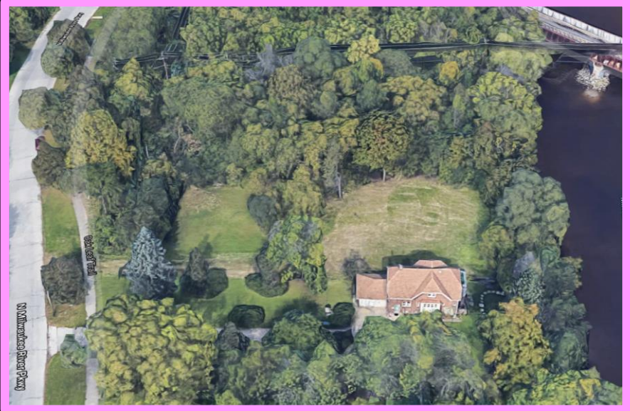
Aerial view looking north