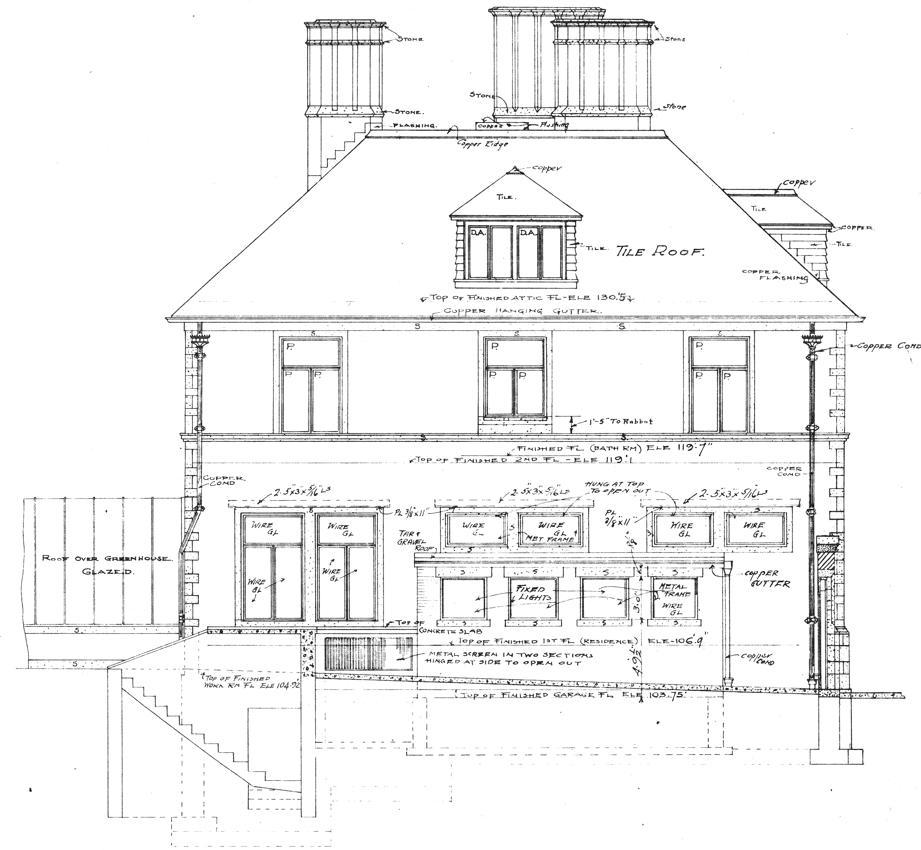
END ELEVATION NORTH