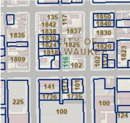
Parcel location within Milwaukee County