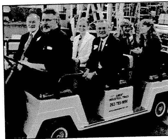
Following the Regional Council's meeting, participants were able to tour Quad Graphic's Sussex facility