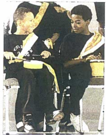
Showtime displays various talents among students at King's Academy Christian School.