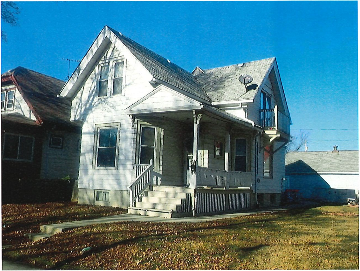
3012 W Hayes