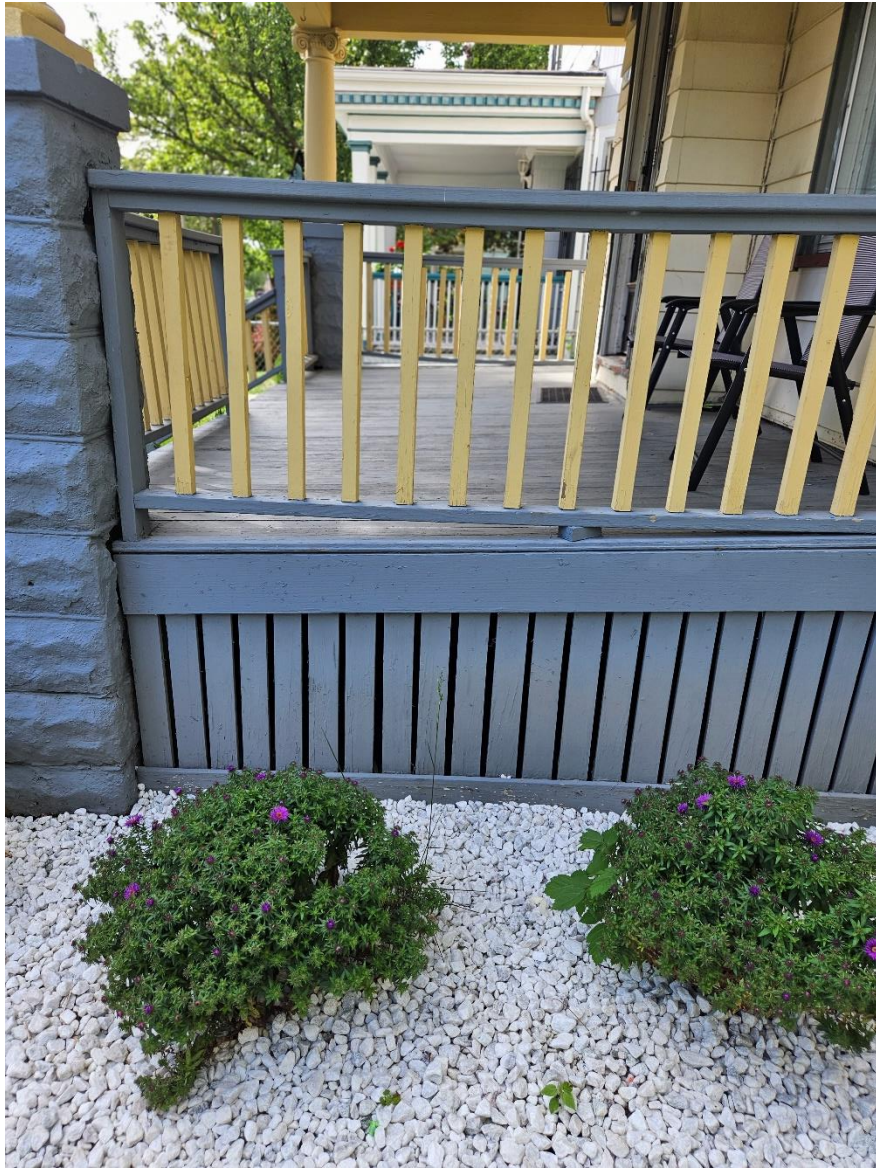
Existing porch is sagging at the front