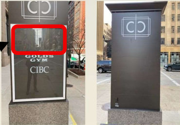
EXISTING TENANT SIGN