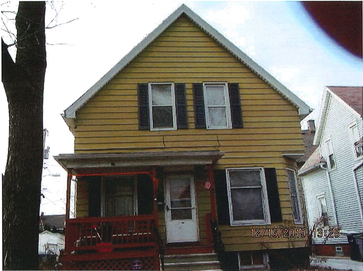
1113 South 37 th Street