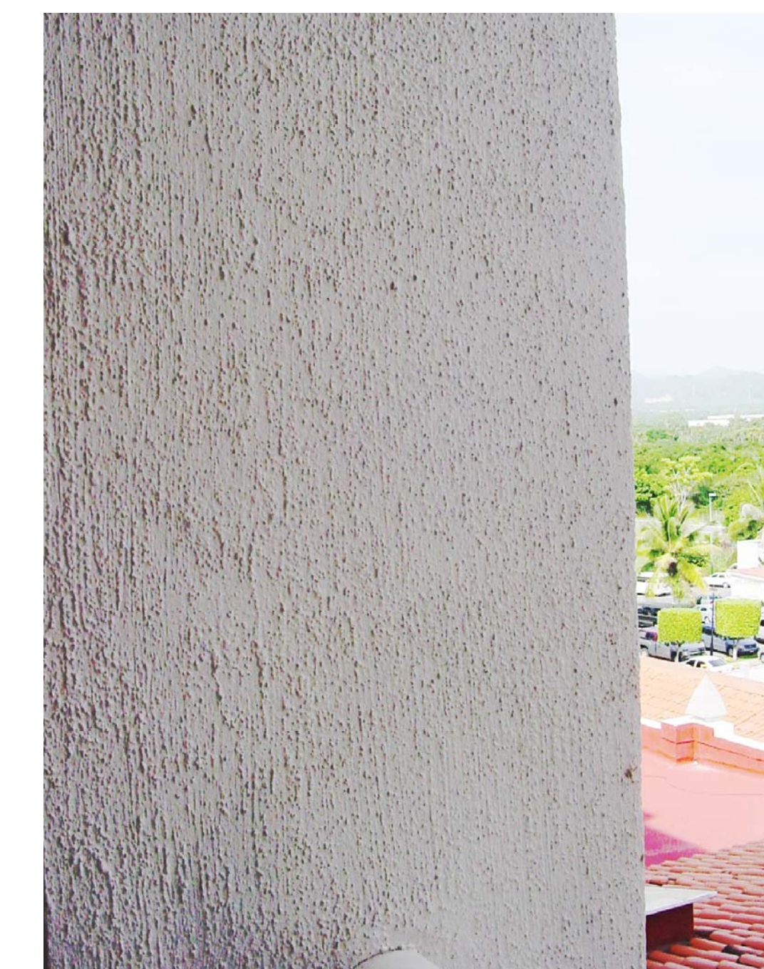
4 STUCCO FINISH SCALE: N/A