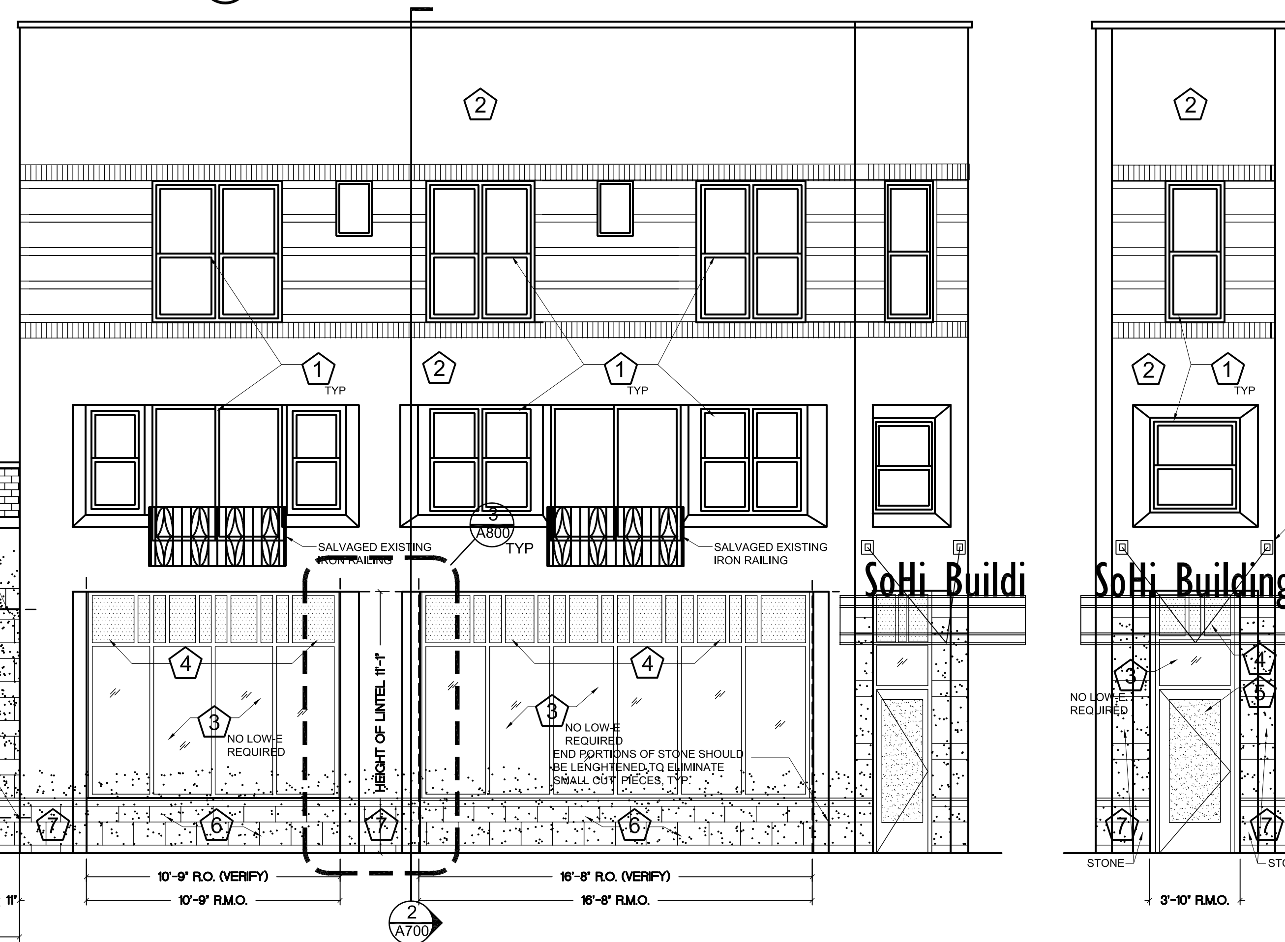
2 NORTH STREET ELEVATION SCALE: 1/4"=1'-0"