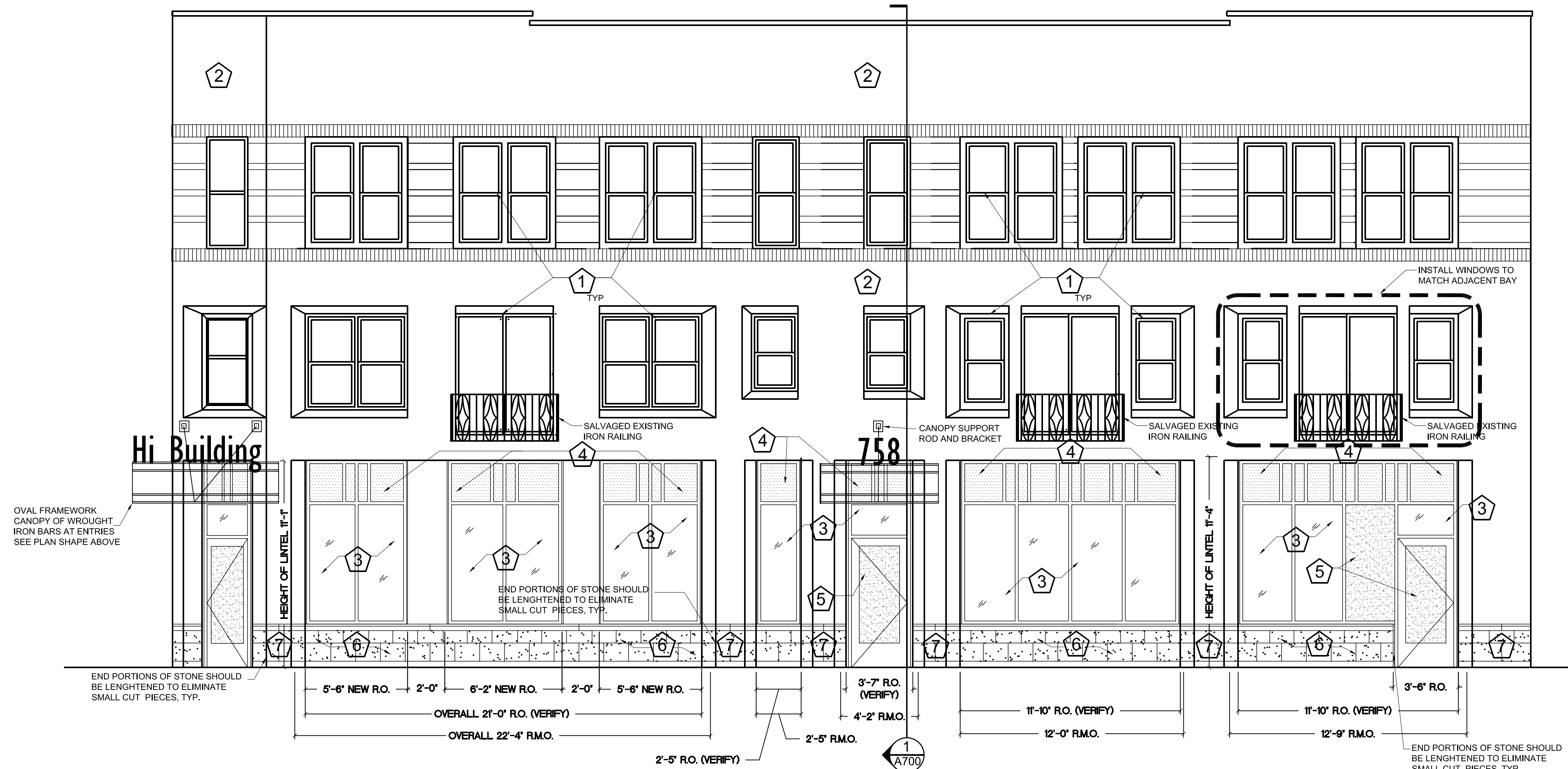
1 WEST STREET ELEVATION SCALE: 1/4"=1'-0"