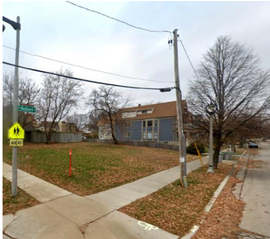
232 EAST BROWN STREET BREWER'S HILL NEIGHBORHOOD

232 East Brown Street, Parcel Number 3530478100. A vacant lot located in the Brewer's Hill Neighborhood and the 6th Aldermanic District, and within the Brewer's Hill Harambee Neighborhood Conservation Overlay District. On the National Register of Historic Places but not locally designated. Zoning is RT4.