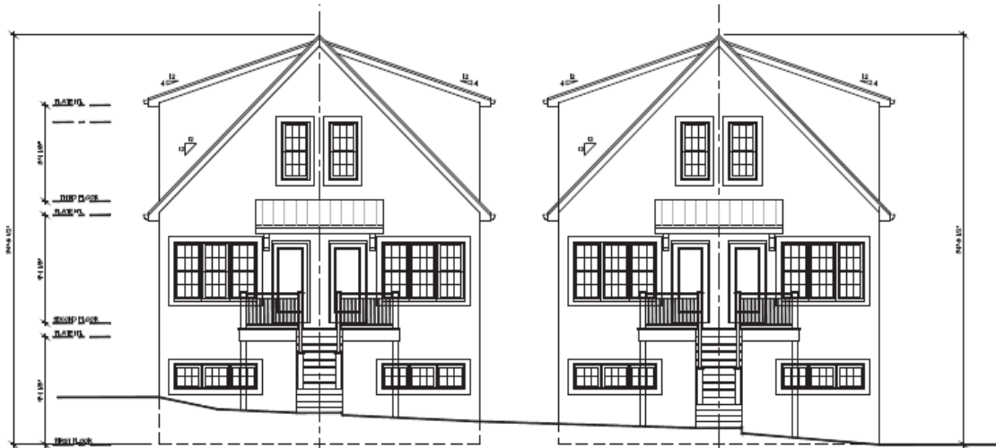
PROPOSED BROWN STREET ELEVATION