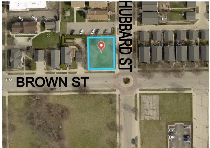
MAP OF AREA PROPERTY DEPICTED IN BLUE SQUARE WITH PIN POINT