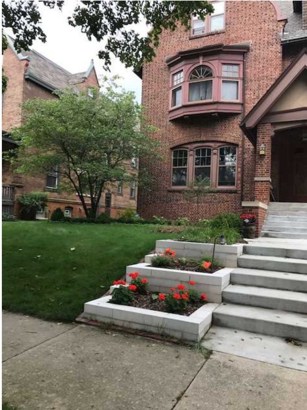
Present conditions 2