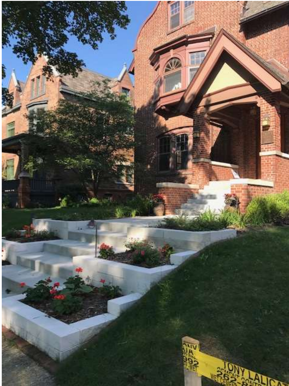
Present conditions 1