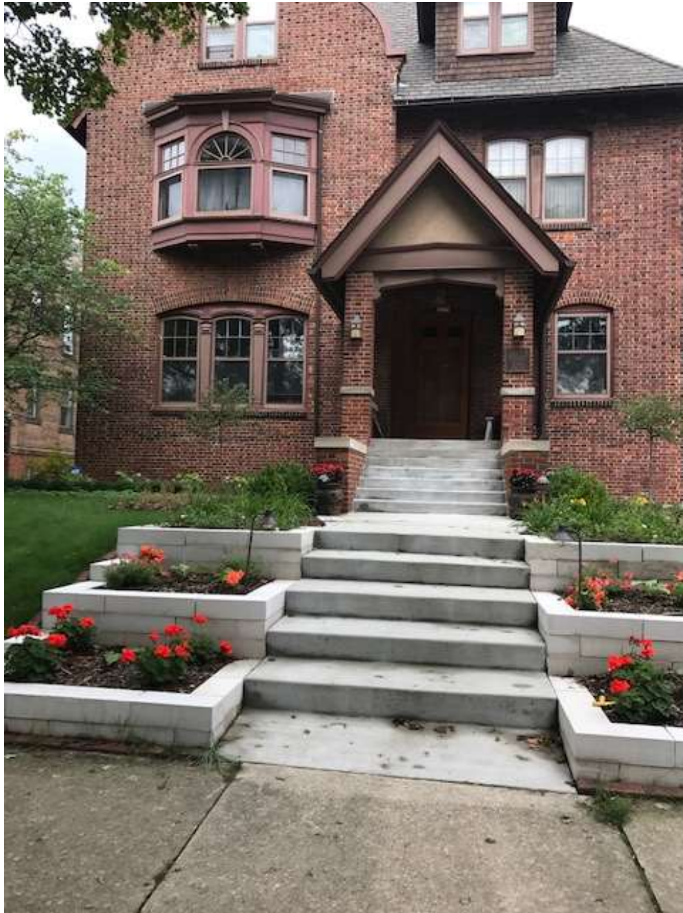
Present conditions 3