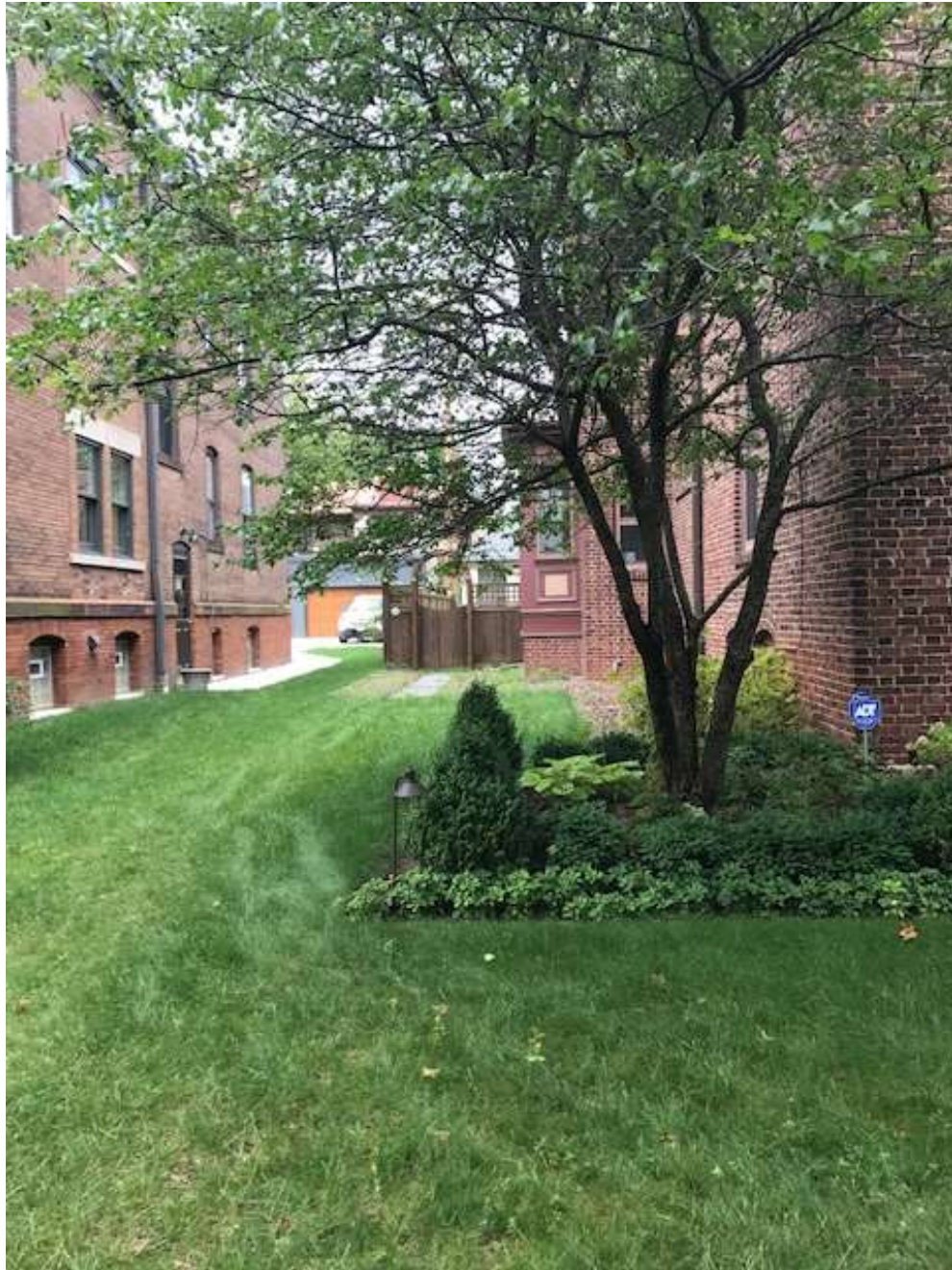
Present conditions 4