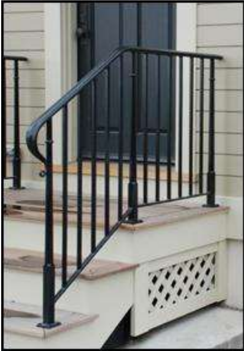
Sample metal railing design. Pickets are optional. Hinges that adjust the slope are not permitted.