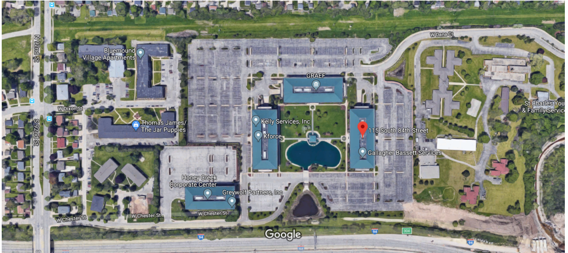
200 ft