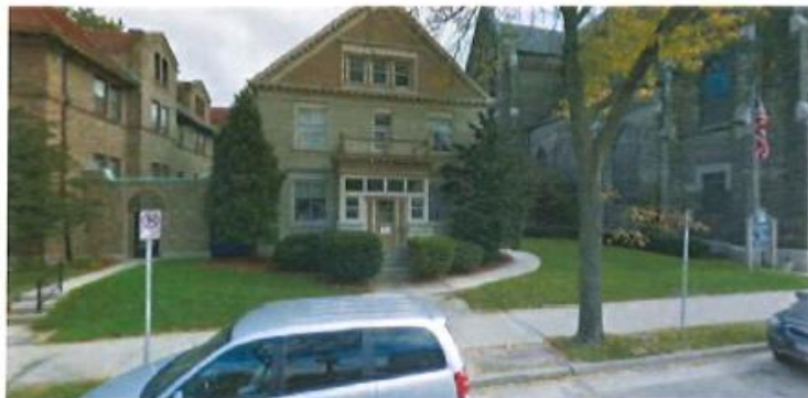
2618 N Bremen St Milwaukee, WI 53212

20 ft