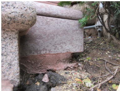
East Cheek Wall Post