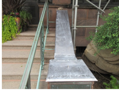
Cheek Wall Flashing