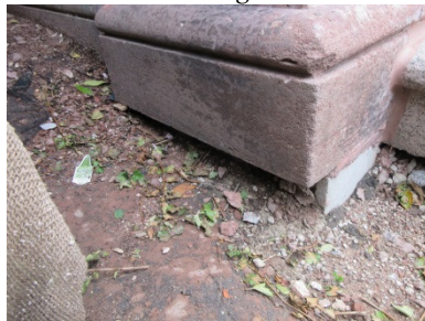
West Cheek Wall Post