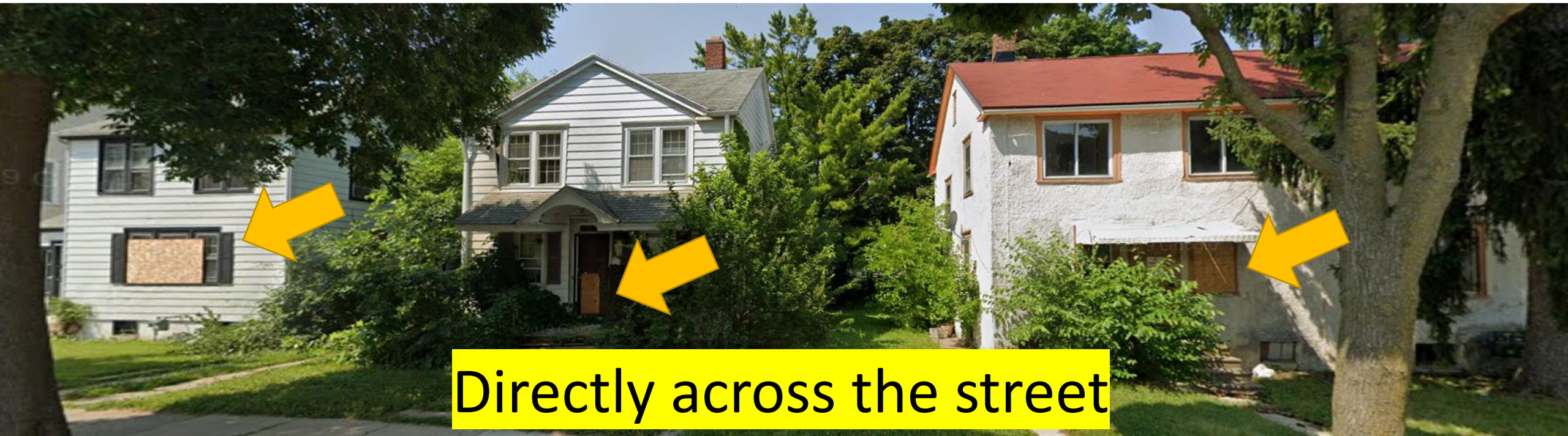
Directly across the street