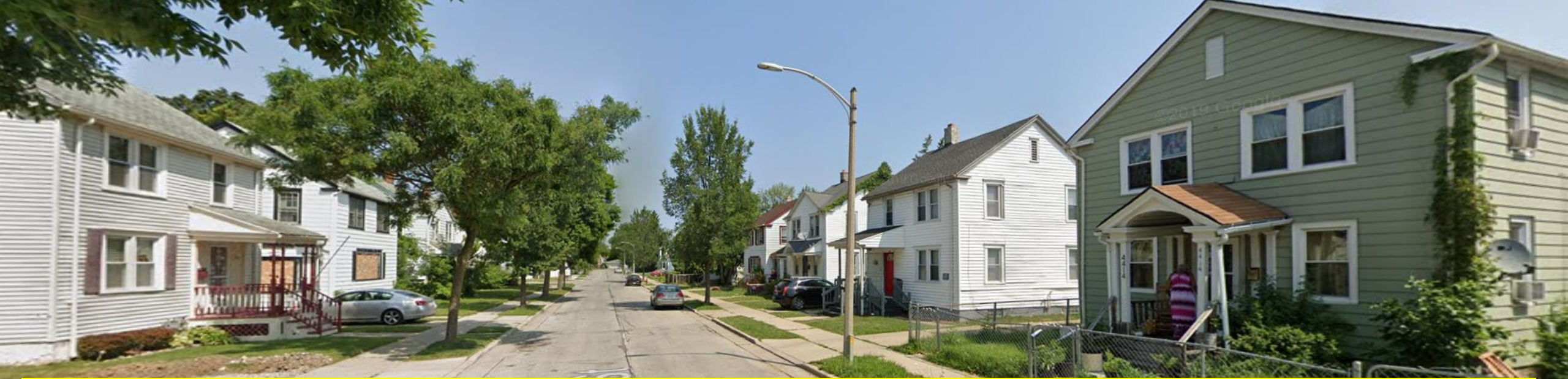
Drive down the street and you won't notice or tell the difference on vinyl vs wood