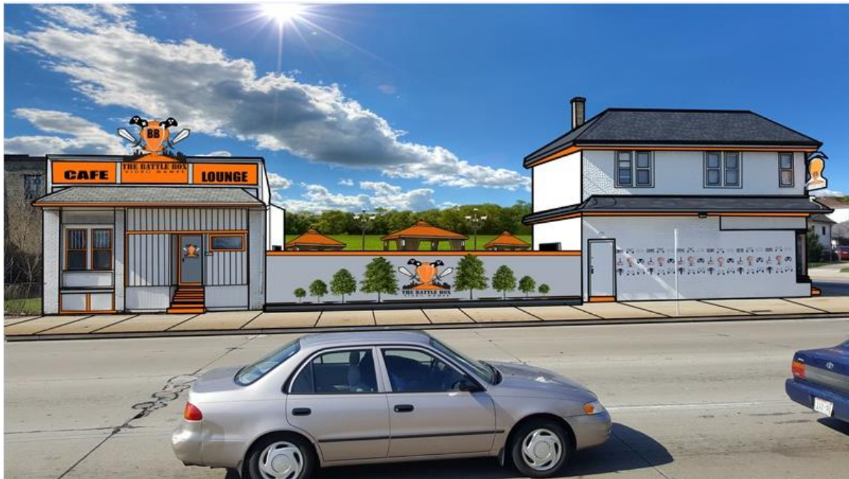
Exterior North view looking south after renovations

The Buyer understands that any changes or modifications to the exterior facade may require approval from the Department of City Development's Planning staff.