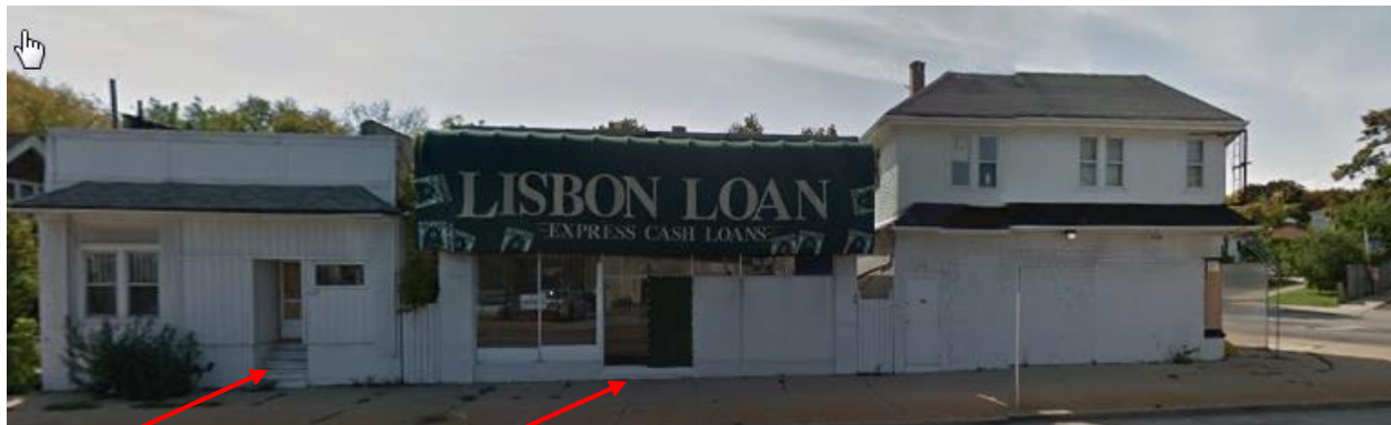
5419 West Lisbon