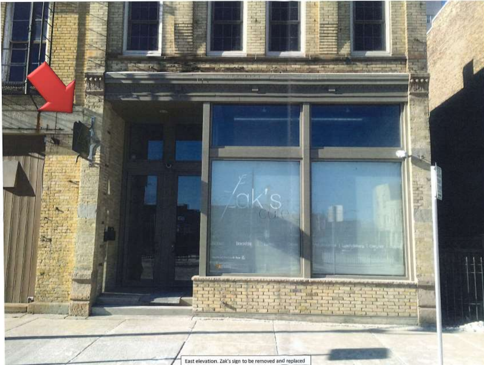
Sign to be removed and replaced in approximately the same location, at a code-compliant height.