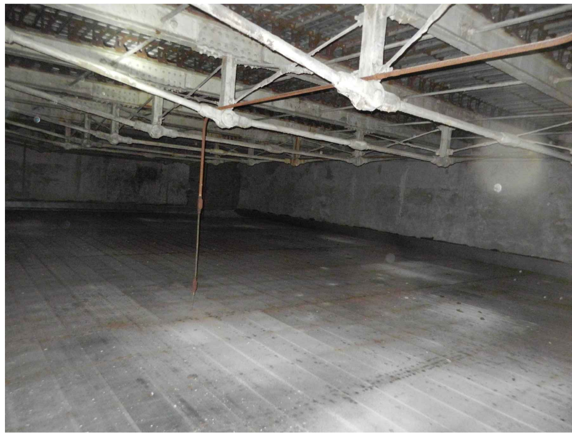
(M1) EXISTING STEEL TRUSSES FROM EXISTING FURNACE AT BUILDING #25 TO BE REPURPOSED IN THE TWO STORY ACTIVITY ROOM AT THE LOWER LEVEL FLOOR.