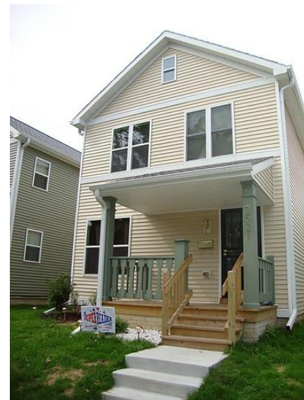
Sample House Design

The properties will be sold "as is" for $1 per lot. Closing will occur within six months of Common Council approval, but in advance of construction to allow Habitat to obtain needed certified survey maps to create building sites. Closing is subject to DCD approval of final house designs and site plans. The Purchase and Sale Agreement will include reversion of title provisions for non-performance. No earnest money or performance deposit will be required based on Habitat's past performance.