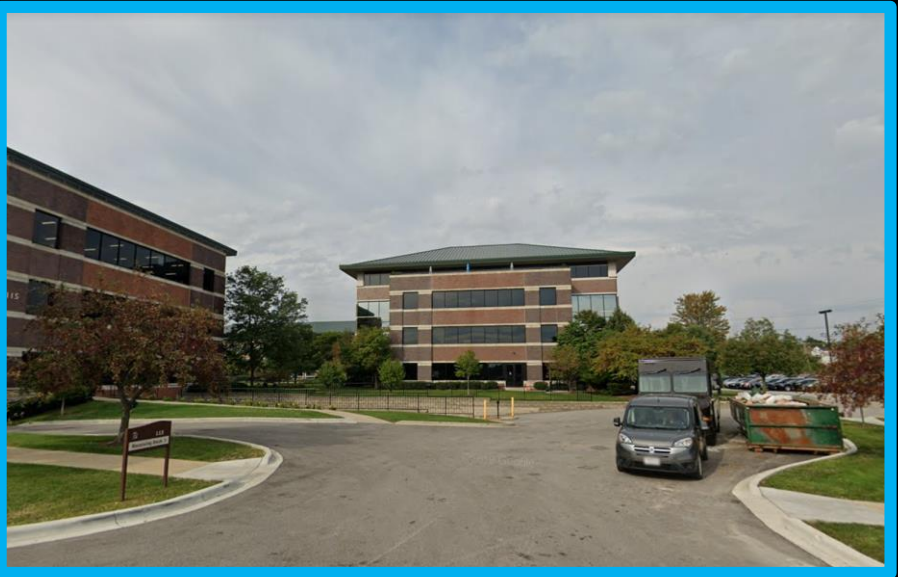
View from parking lot looking west