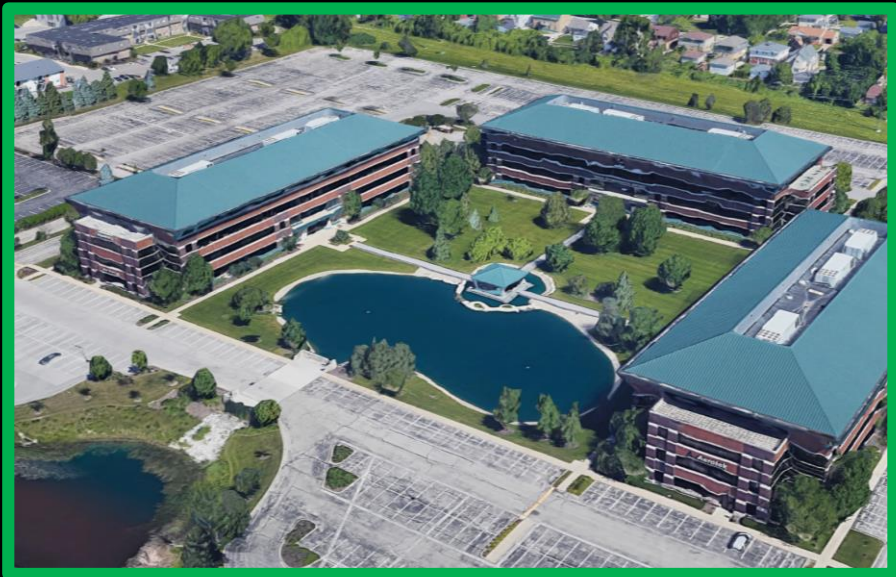
Aerial view looking north-west