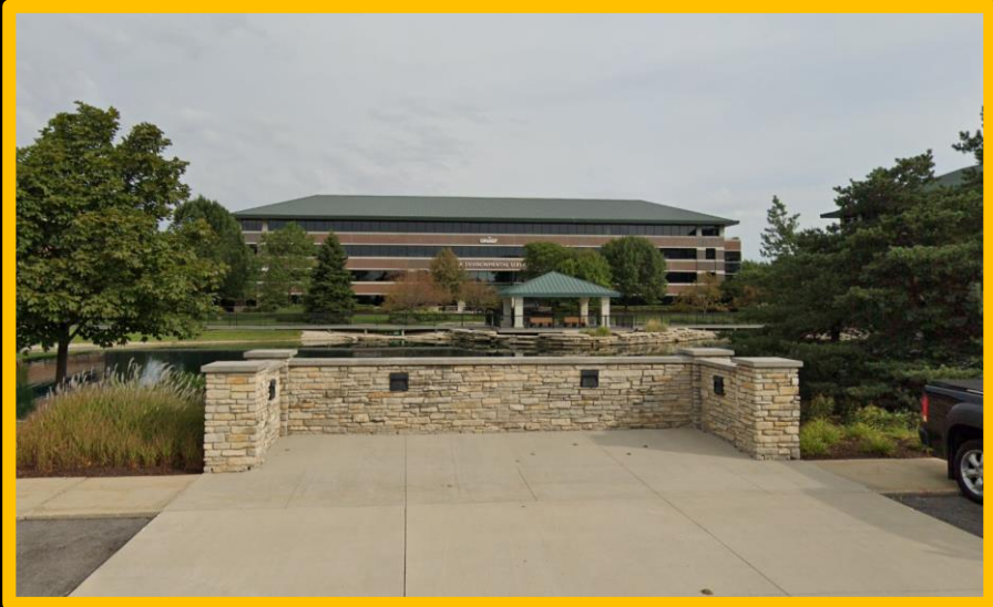
View from parking lot looking north across pond