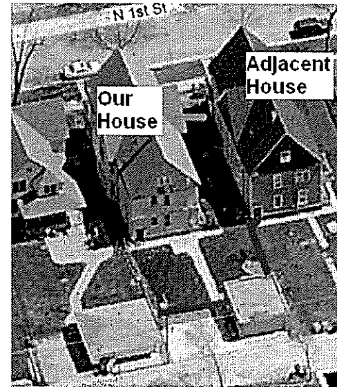
Style and location of new wood fence

Red = 6 foot high picket Green = 4 foot high picket