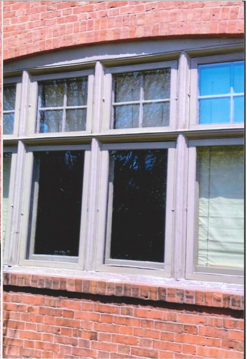
Typical existing storm windows