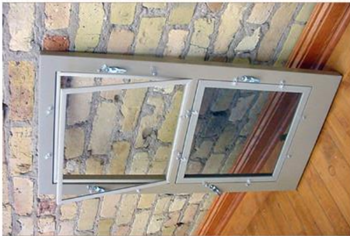
Typical proposed storm window