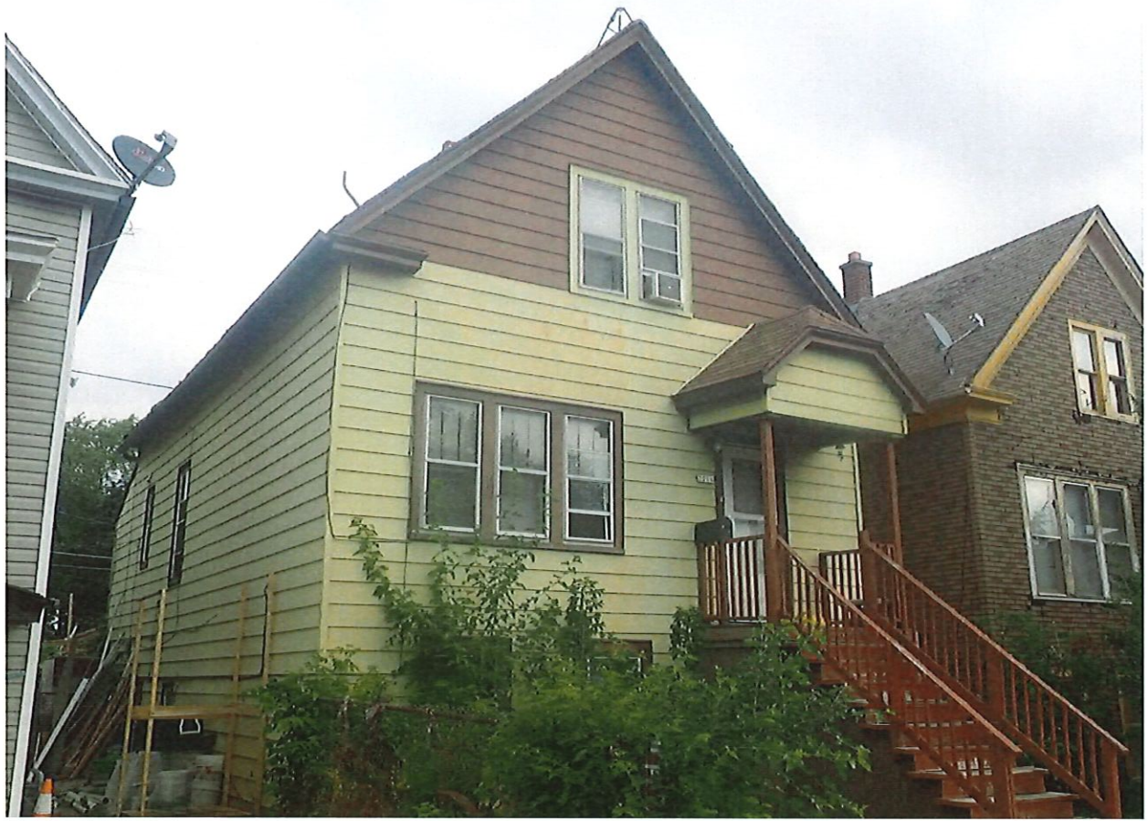
2012-14 W Lincoln Ave