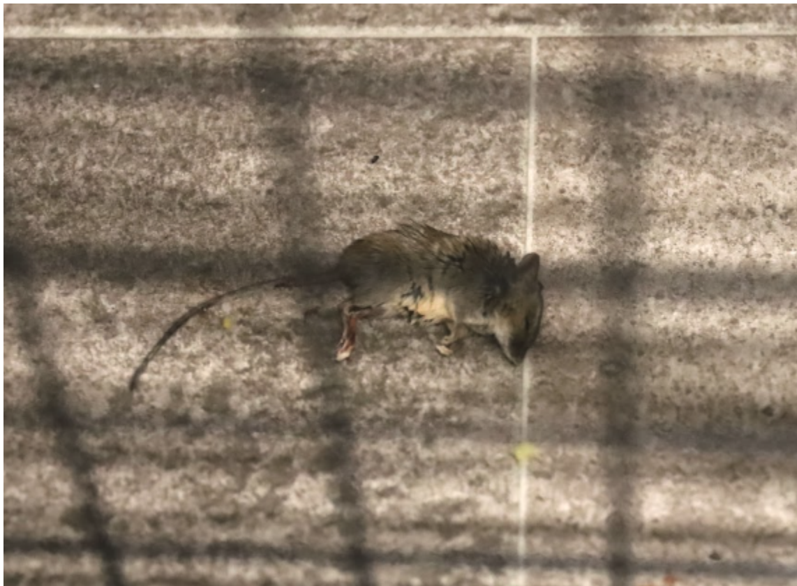
Description: dead mice in HACM's "award-winning" Westlawn. The development was built on top of a mice breeding ground. It is infested.