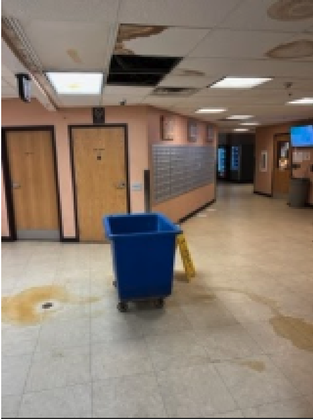
Description: the downstairs “ceiling” at Riverview. Water is leaking with exposed wires. Residents frequently slip, particularly when using a walker or mobility device.