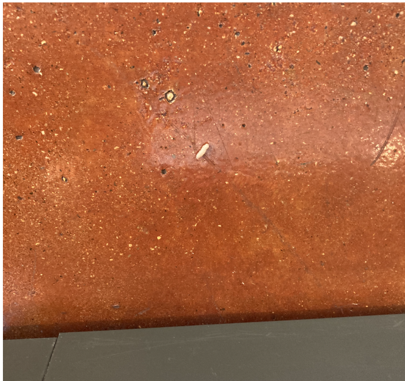
Description: another common bug inhabitant at Locust Court and other properties...