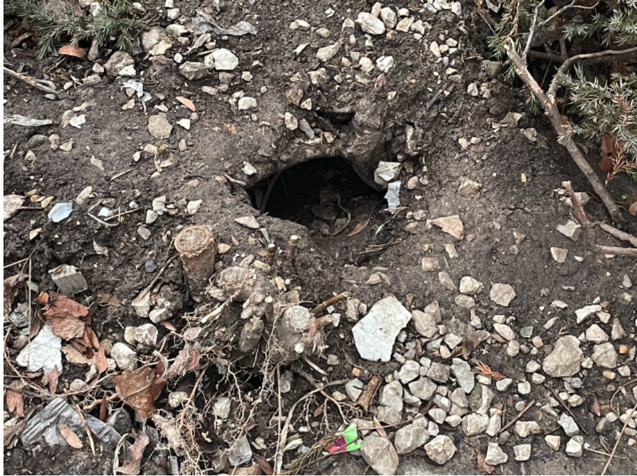
Description: rat hole at Hillside. The property is littered with these. Rats and other vermin are regularly in residents' apartments.