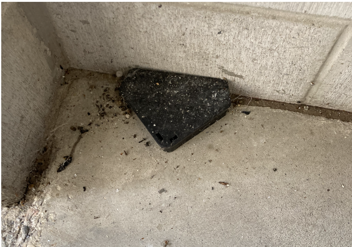
Description: Cherry Court is littered with traps like these. The garbage room is infested.