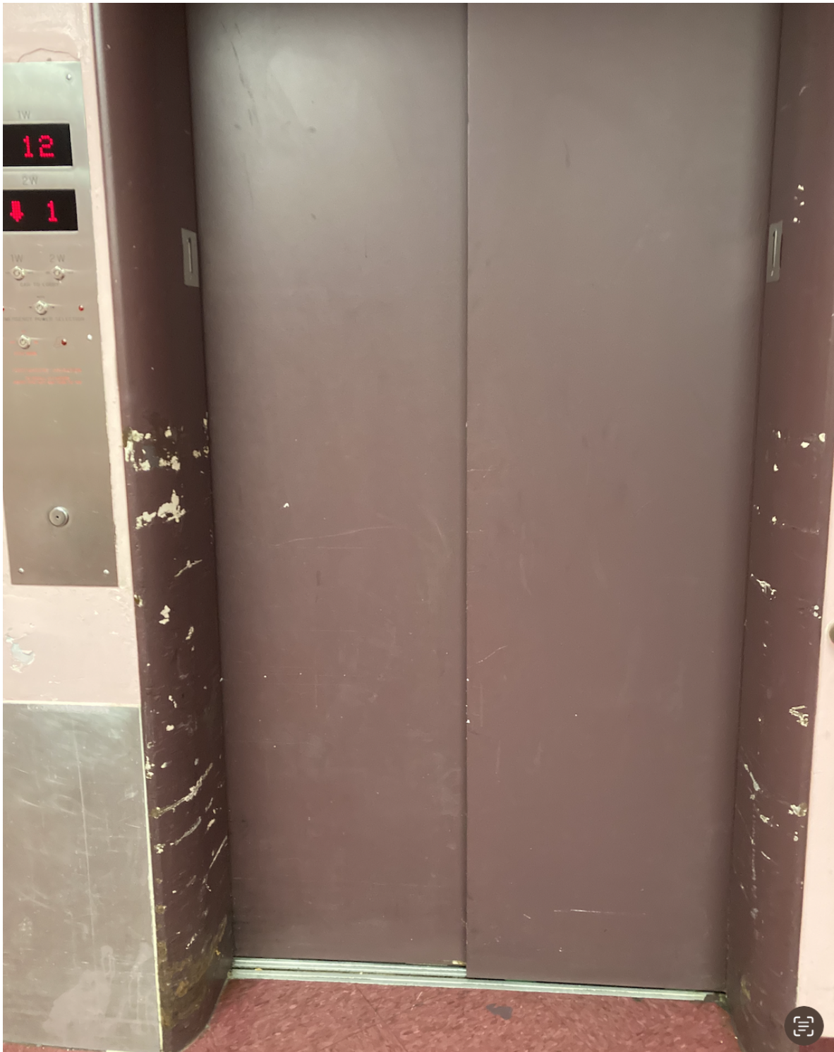
Description: residents at College Court—and many other properties—frequently struggle to fit into the small doorways with their walkers/wheelchairs, scratching the sides and hurting their hands or devices.