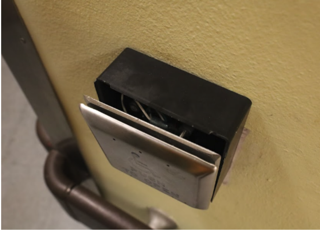
Description: Lincoln Court and other properties often have busted Automatic Door Openers (ADOs) like this—making the building inaccessible for people with disabilities.