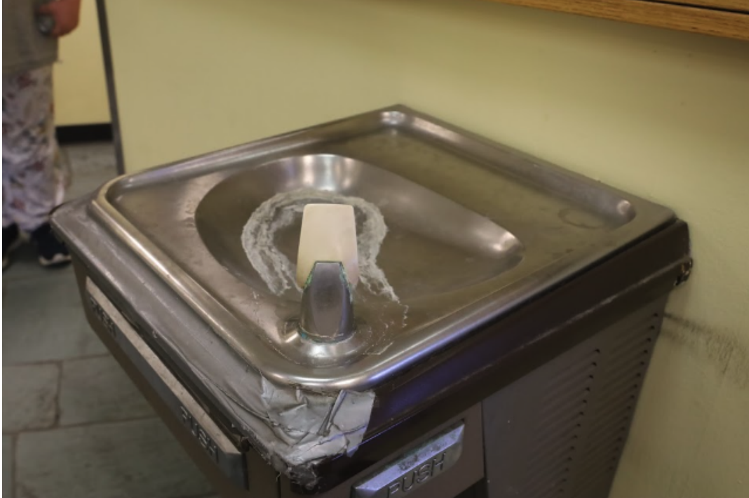
Description: the communal water fountain at Lincoln Court. Residents never use the fountain.