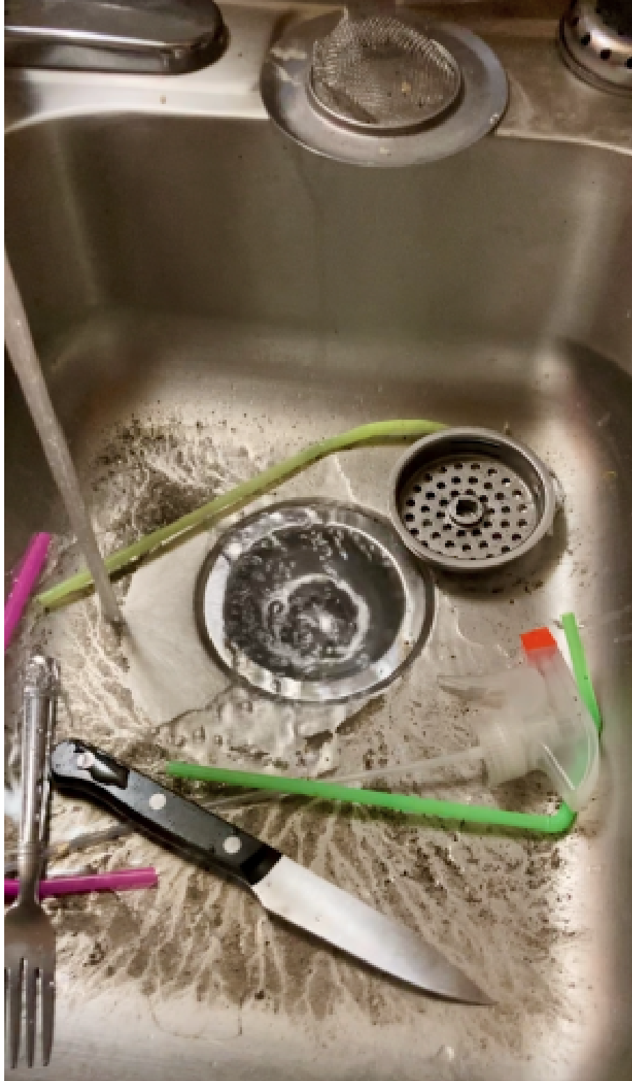
Description: one of many units at College Court with plumbing issues. When the resident turns on the faucet, the sink clogs and begins to fill, bringing up dirty brown material from the pipes, as pictured.