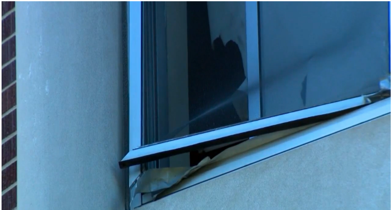
Descriptions: Broken windows and screens at College Court. Dozens of units have similar problems.