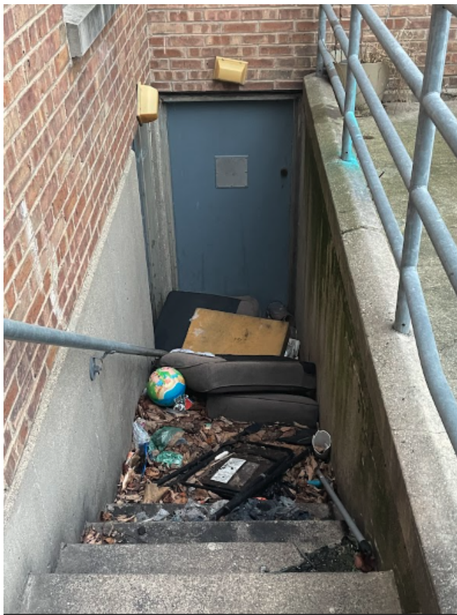
Description: an “emergency exit” at Hillside blocked with garbage