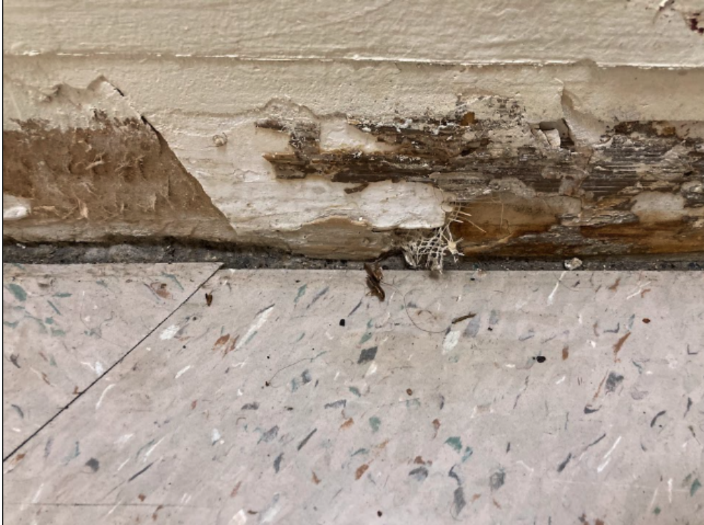
Description: busted baseboards and a dead roach on the downstairs hallway floor at Locust Court. The building is infested with roaches and bugs—even on elevator walls.