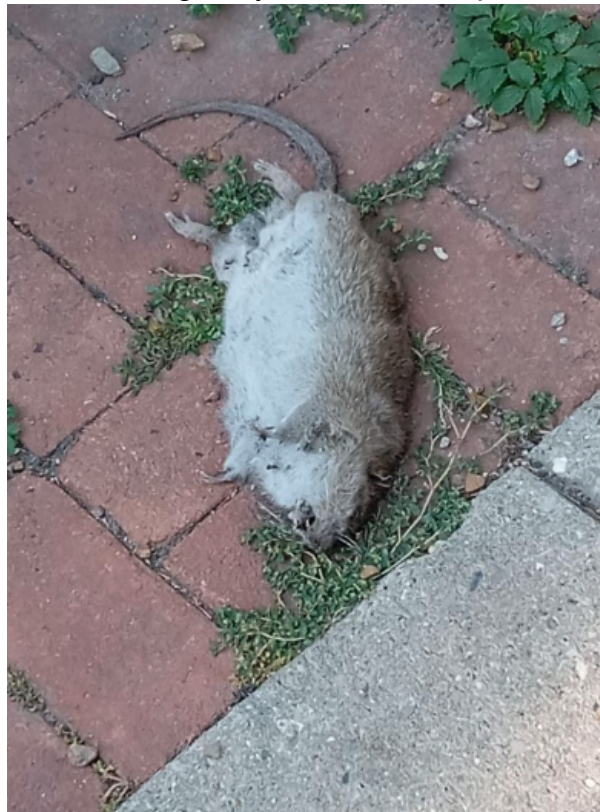
Description: a cat-sized rat seen recently by Vivian Jones at Lapham Park. These are weekly sightings.