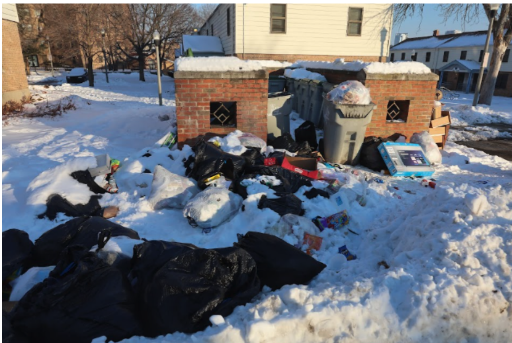
Description: one of many garbage pile-ups at Hillside; a breeding ground for rats