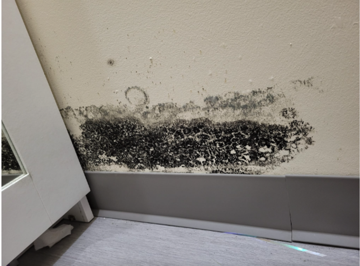
Description: black mold in Teddi Minor's apartment in Becher Court. She reported concerns of water leaking, but HACM told her she just had "creaking pipes."