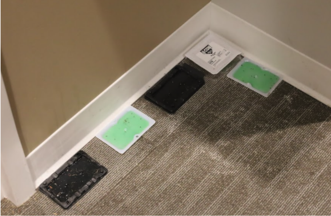
Description: Westlawn has traps for bugs and mice like these everywhere.