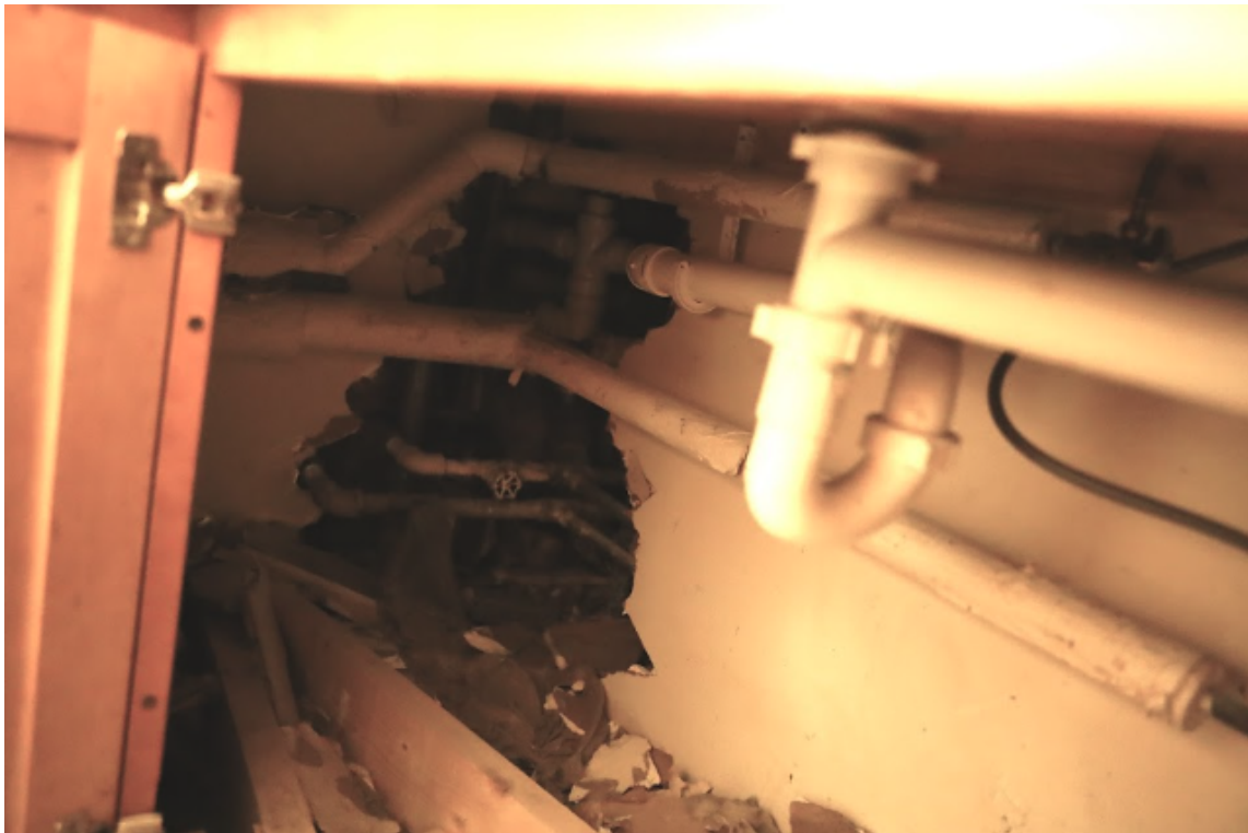
Description: a large hole beneath the sink in an apartment of Lincoln Court. Such holes are very common.