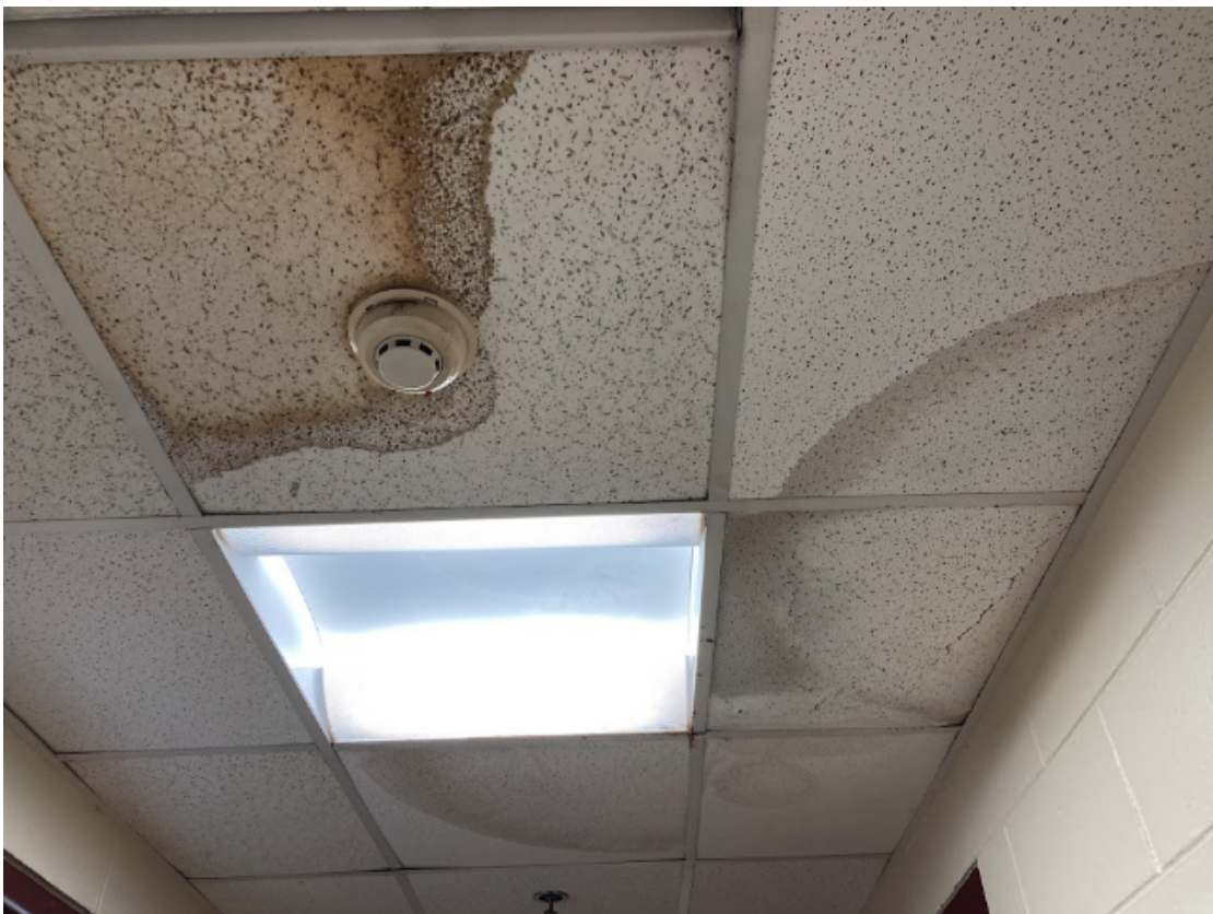
Description: the communal “ceiling” at Locust Court. You can see water leak marks. It has been left in this state of disrepair for months.