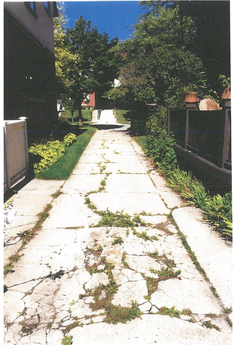
Site plan for new concrete work. Current condition of driveway at right.