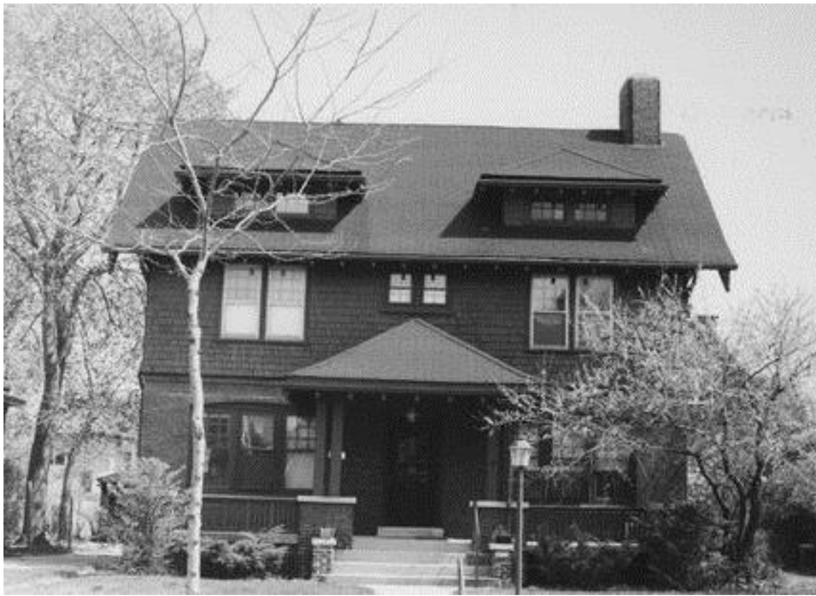
2674 North Summit. 1980 survey photograph.