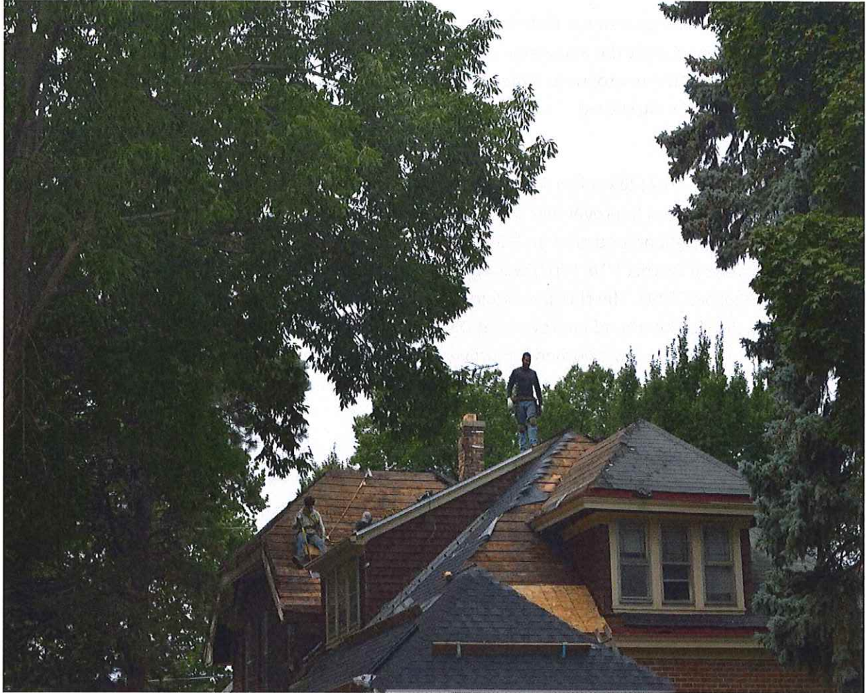
Harambee Home Completed in 2018