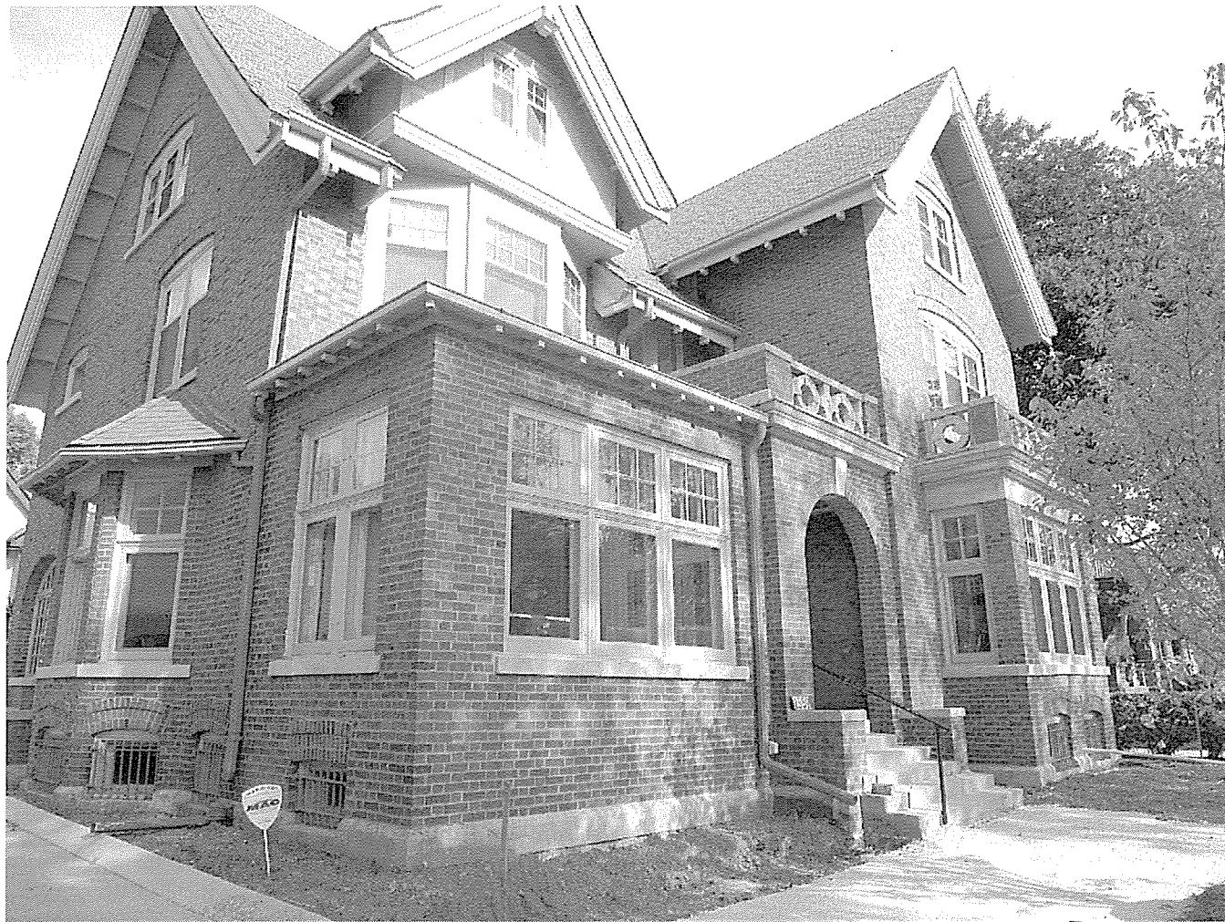
Location of front terrace