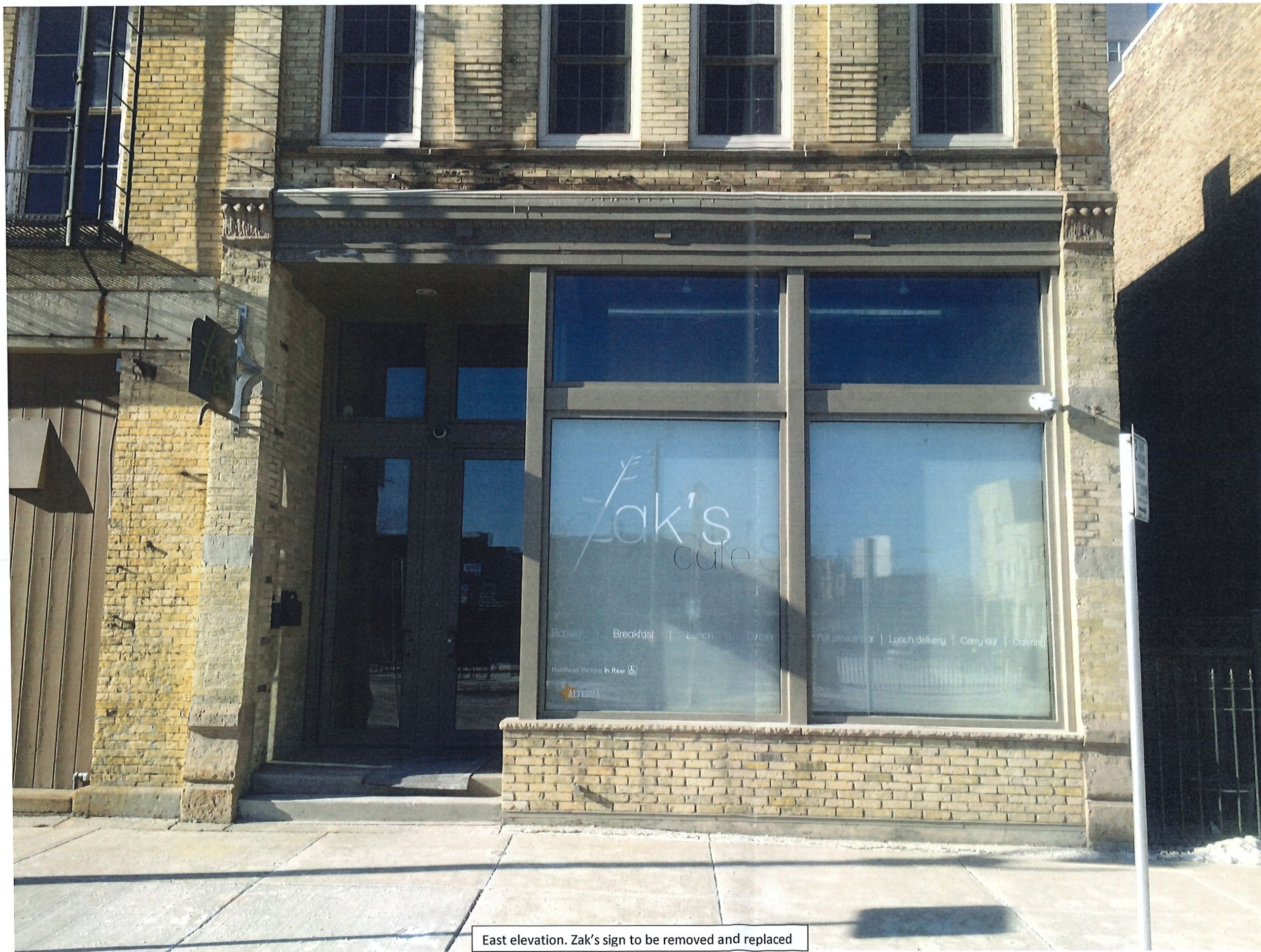
East elevation. Zak's sign to be removed and replaced