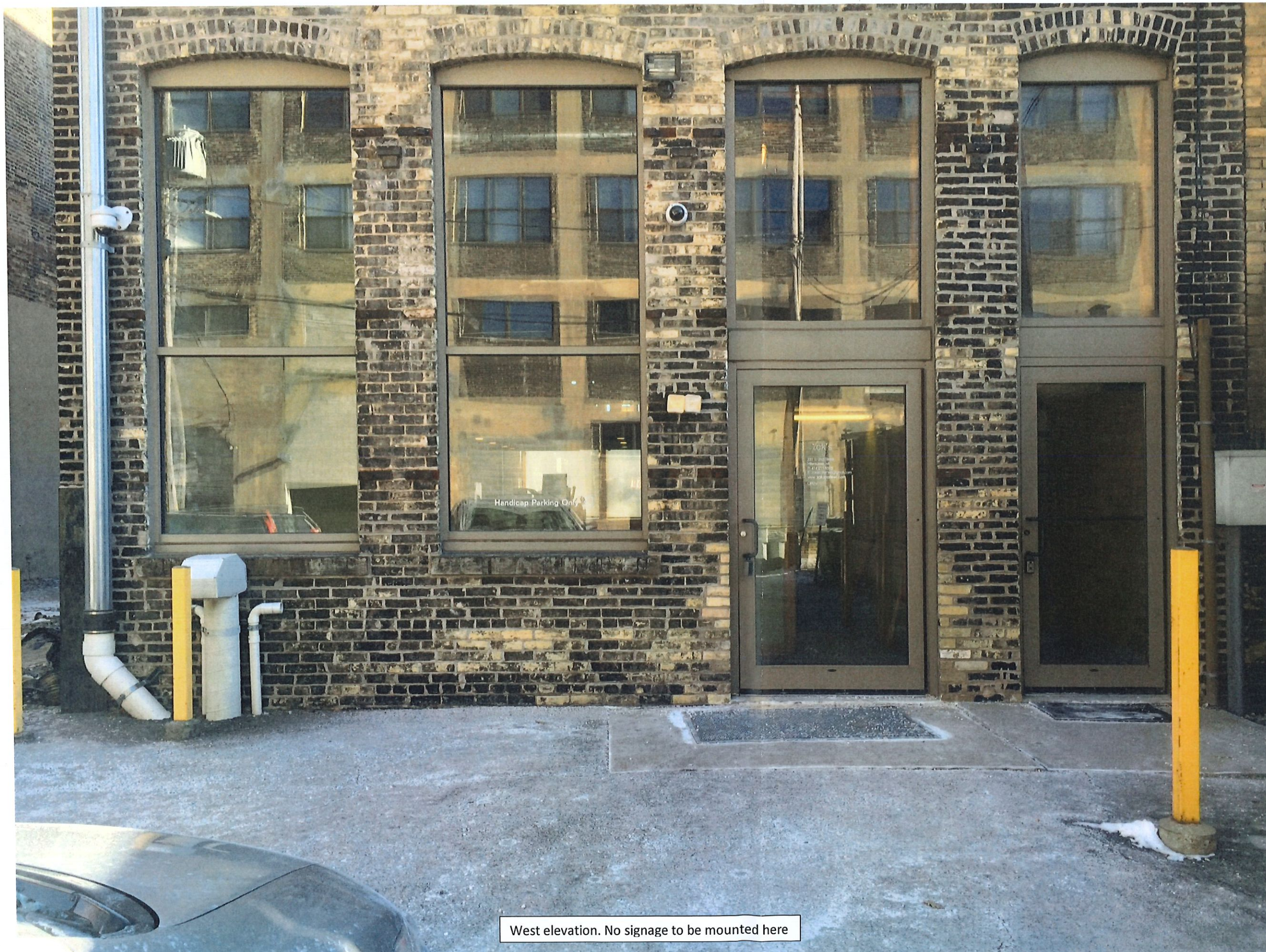
West elevation. No signage to be mounted here