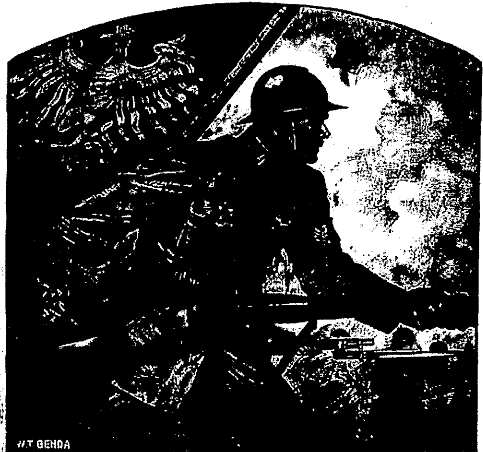
Recruitment poster, by Władysław Teodor Benda, published in the USA in 1917