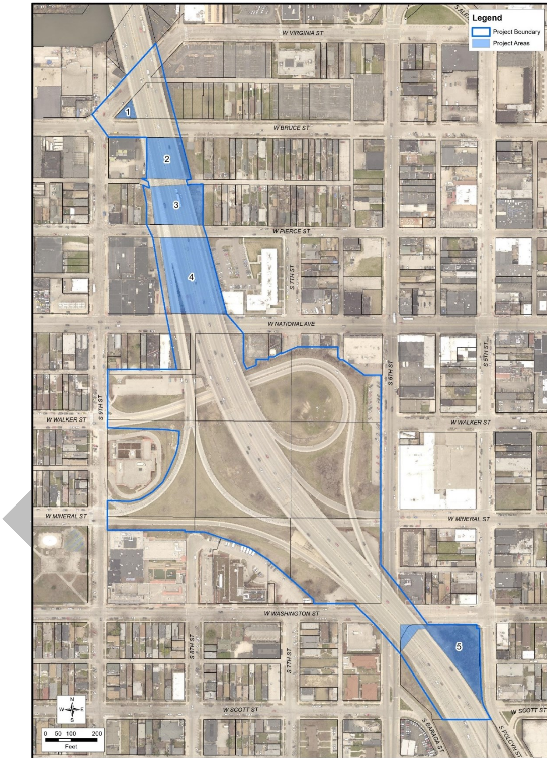
Exhibit A Map of Mineral Street Overpass Green Infrastructure