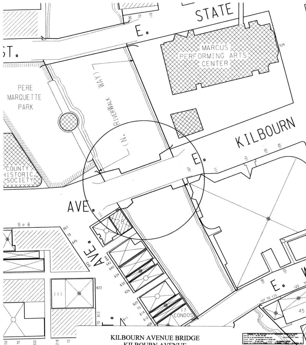
KILBOURN AVENUE BRIDGE KILBOURN AVENUE OVER THE MILWAUKEE RIVER Section 28 Town 7 North Range 22E WisDOT P-40-881