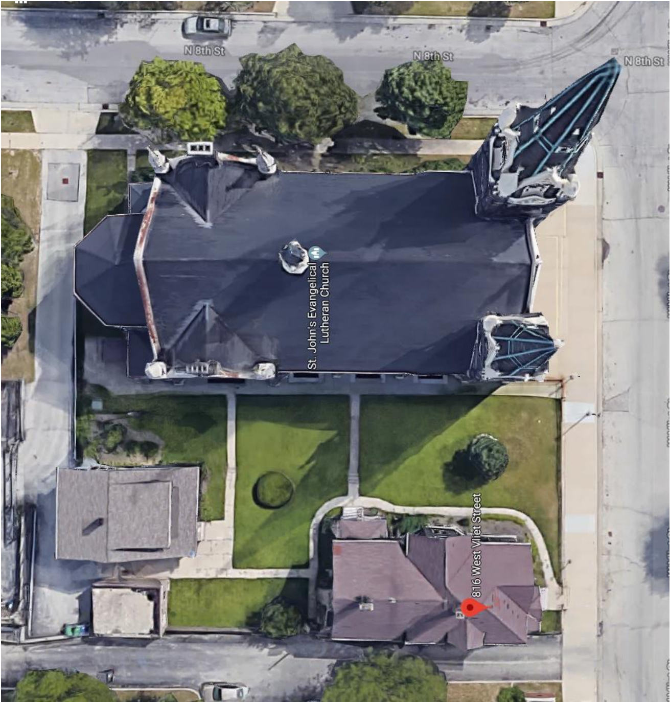
Existing site conditions.