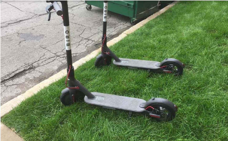
A pair of Bird scooters on E. Menomonee St. in the Third Ward

A number of black, electric scooters popped up throughout the Third Ward this morning. These scooters are from Bird, a dockless, electric-scooter share company based out of Santa Monica, Calif.