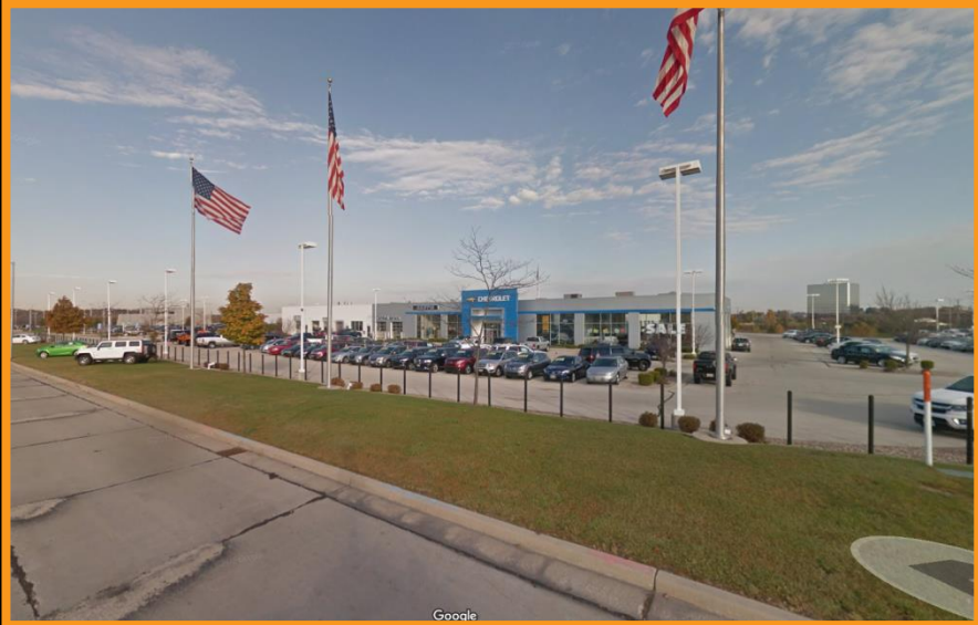
View from West Metro Auto Mall looking northwest