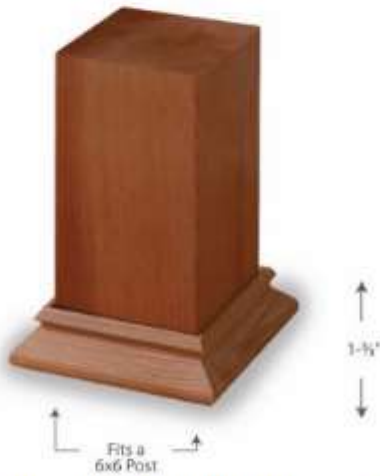
Southern Belle Handyman Kit — 6x6