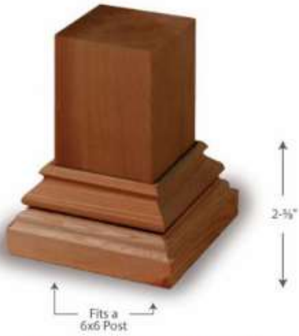
Country Gentleman and Southern Belle Combo Handyman Kit — 6x6