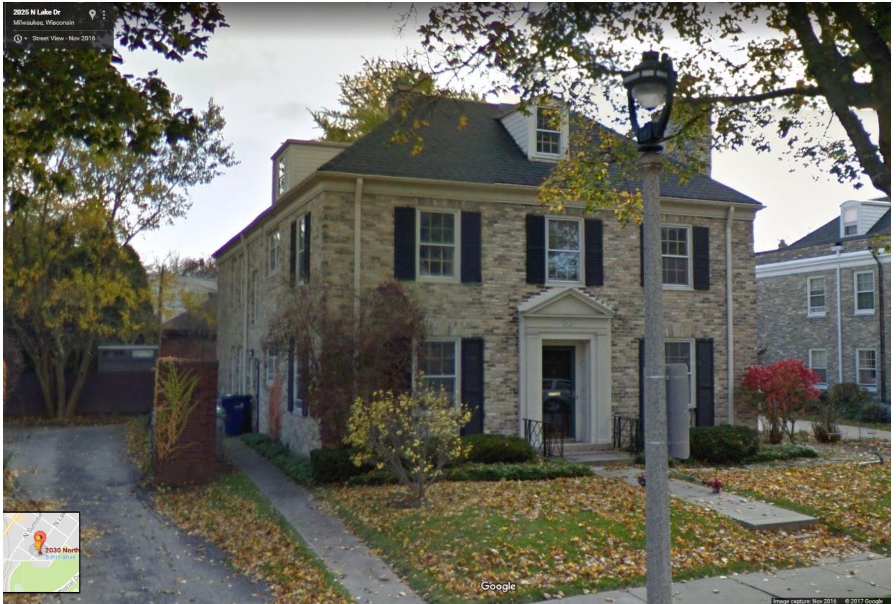
Front view of property