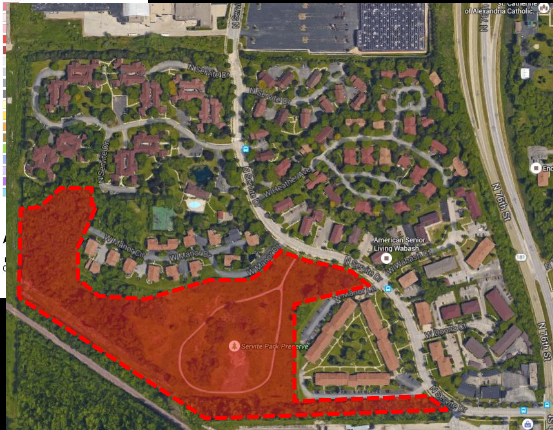
Part of Servite Park Preserve 8501 North Servite Drive