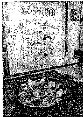
By PAUL GORES pgores@journal sentinel.com

State group spreading word on micro lending for women, minorities