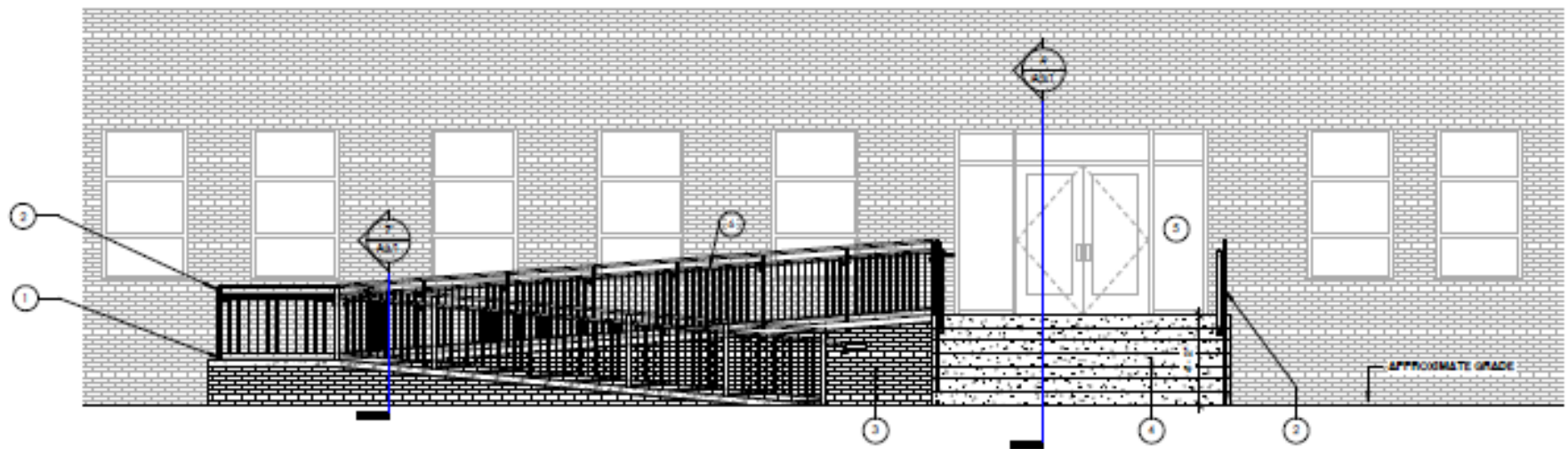
1 ENTRY STAIR RENOVATION ADD. AT. 0 1/4" = 1'-0"